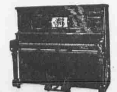
Aeolian Player-Piano Anniversary Price $395 Delivered on first payment of $10

The Instruments are of Fixed Standard Value Every instrument at Heppe's is marked at a reasonable price that is fixed and irrevocable. It is the same to everybody. The instruments displayed at Heppe's have more than local fame. They enjoy an international reputation. In player-pianos Heppe's have a complete line of the great Aeolian instruments, including the greatest of all player-pianos—the genuine Pianola in such pianos as the Steinway, Weber, Wheelock and Stroud. In pianos they have a large variety of the Heppe patented three-sounding board pianos, also the Weber, H. C. Schomacker, Marcellus, Edouard Jules and Francesca styles. It is on these instruments that this proposition is now offered.