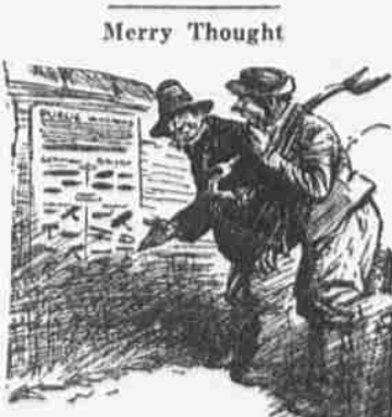
First Rustic-But supposin' they be so high ye can't tell which is which? Second Ditto-Aya, there ye be. Ya'd have to wait about and see whether they drops any bombs; if they do, they be Germans.

Magistrate-Everybody says the man drowned himself, but you insist it was an accident. What are your reasons? Pat-Sure and they found a bottle of whisky in his pocket, and if he'd drowned himself on purpose, he'd drunk that first.