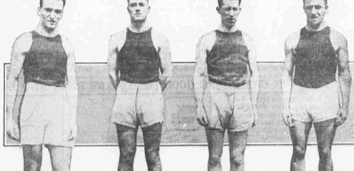
Pennsylvania pin their faith in the four athletes pictured at the top. They are the half-mileers at the University, who will arrive for the 2-mile relay title.