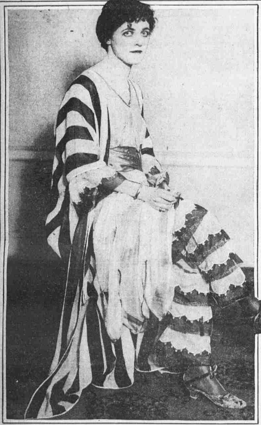
RED, WHITE AND BLUE TROUSERETTES FOR SPRING A costume which caused a great sensation at a recent fashion show in New York. The "panties" are decorated with scalloped frills which bear tiny tassels.