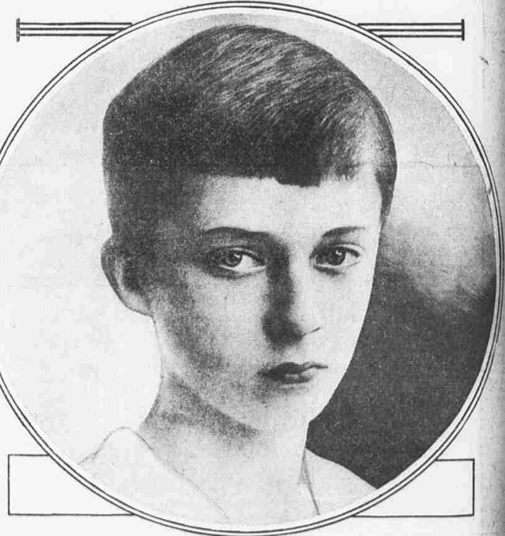
BELGIUM'S CROWN PRINCE Recent dispatches assert that Leopold, oldest son of King Albert, has shouldered a gun and gone to the front, though he is only 14 years old.