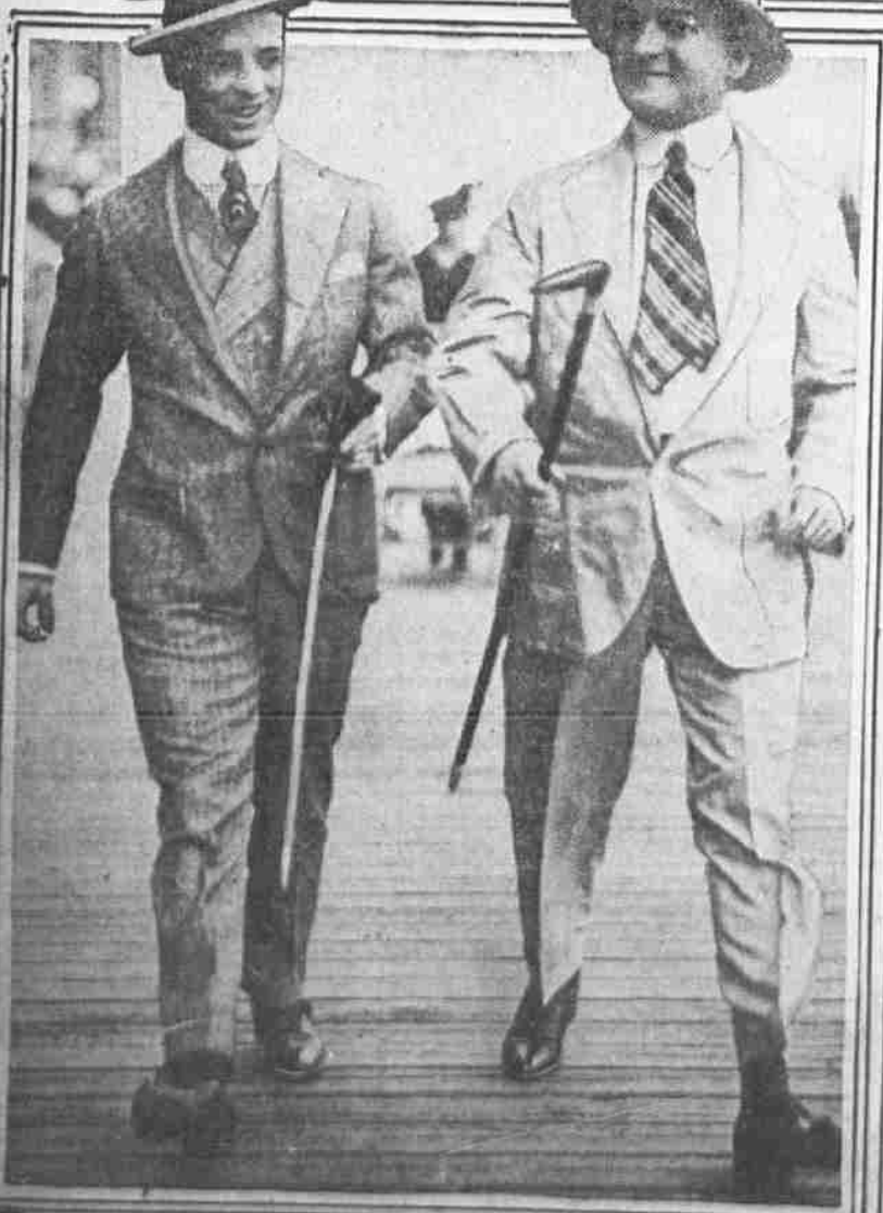
SEASIDE FASHIONS FOR MEN What's what for summer attire in the male world of fashion may be judged from this Boardwalk picture. Coats will button tightly around the waist and hats apparently will have their brims turned down.