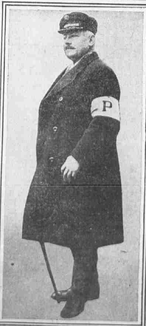
THE GERMAN FIELD CENSOR He has charge of the newspaper men on the war front.