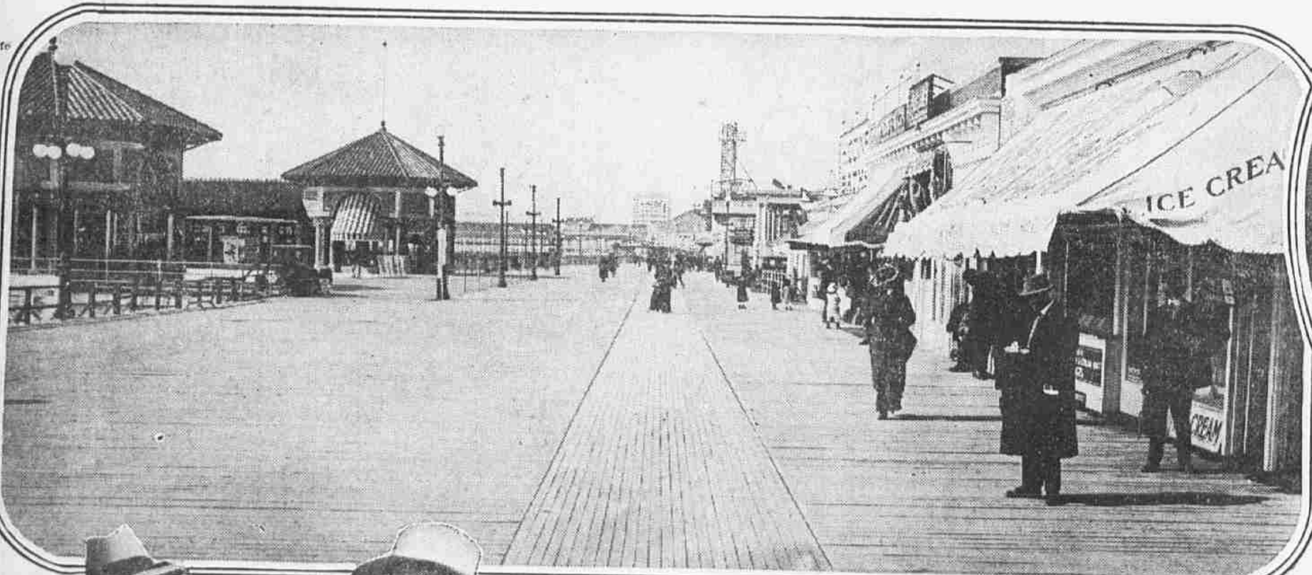
EASY ROLLER CHAIR TRAVEL This strip of planking has just been laid lengthwise for about four blocks south from Connecticut avenue. It will obviate Boardwalk bumps.