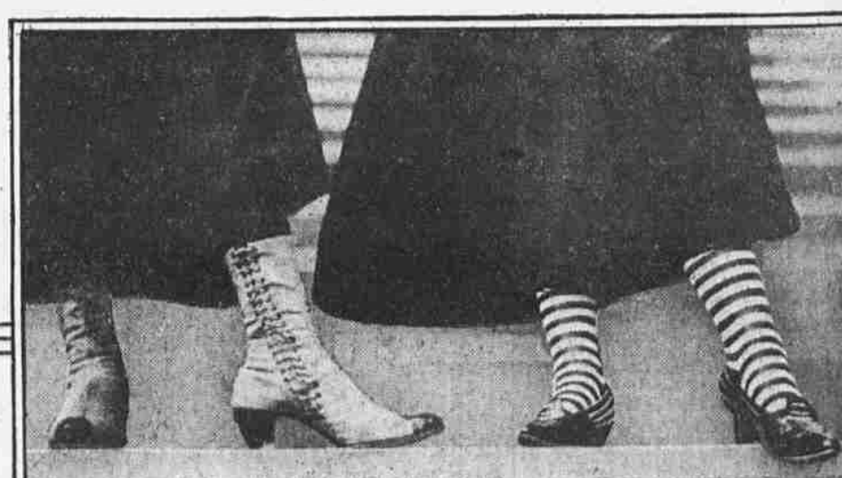
SIDE-LACED SHOES AND ZEBRA STOCKINGS WERE NOTED