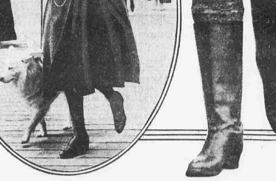
RIDING ON THE BEACH IS POPULAR