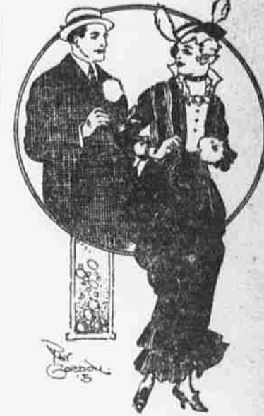
He-I don't understand why you always take two days to go shopping. She-Oh, that's very simple. I shop one day and exchange the next,