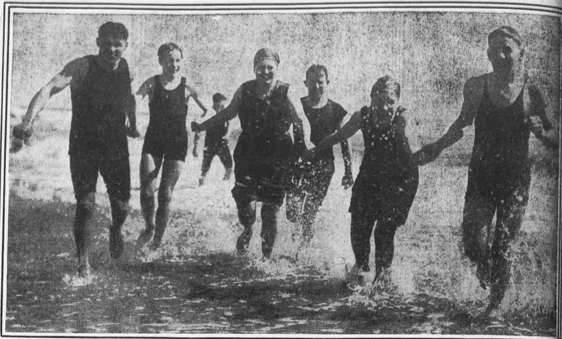
SPRING ENTICES THE SURF BATHERS These warm days have had the effect of opening Atlantic City's bathing season early, despite recent unfavorable weather.