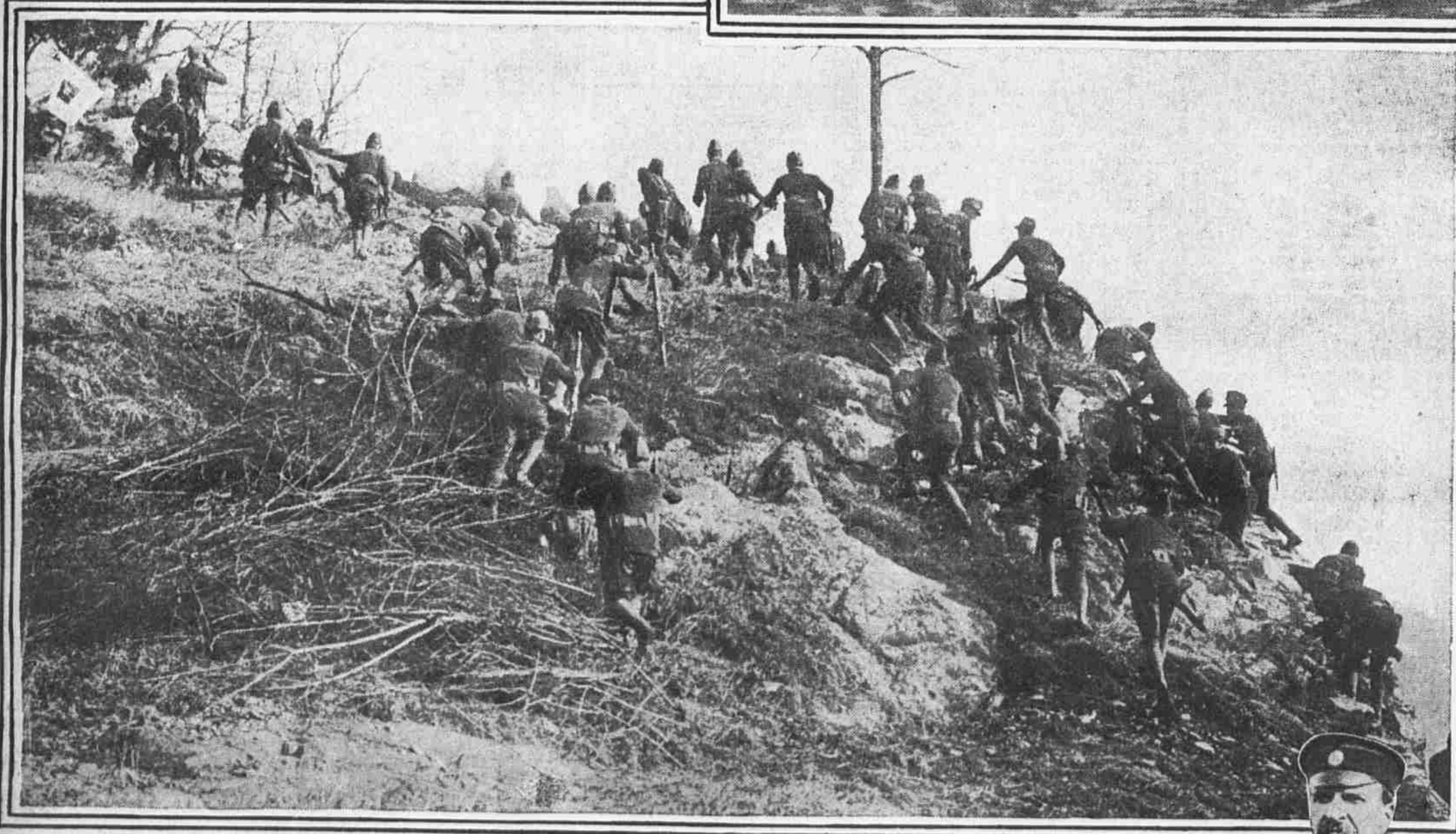
YOU MAY NOT RECOGNIZE THEM AS SUCH, BUT THEY ARE UNITED STATES SOLDIERS At first glance any one might think this was a scene from one of the European fronts, but as a matter of fact it comes from no further away than the Catskill Mountains and shows some of New York State's soldiers charging over a hilltop during maneuvers. Their unfamiliar head-pieces are modeled after the famous "coonskin cap" worn by Davy Crockett and other pioneers who spent most of their times in the hills and forests.