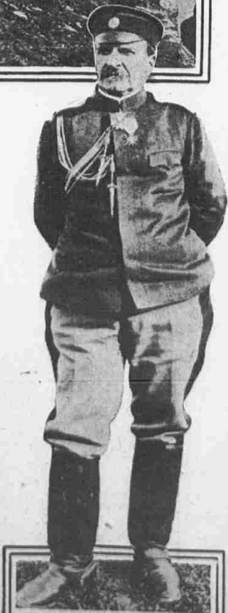
CONQUEROR OF PRZEMYSL