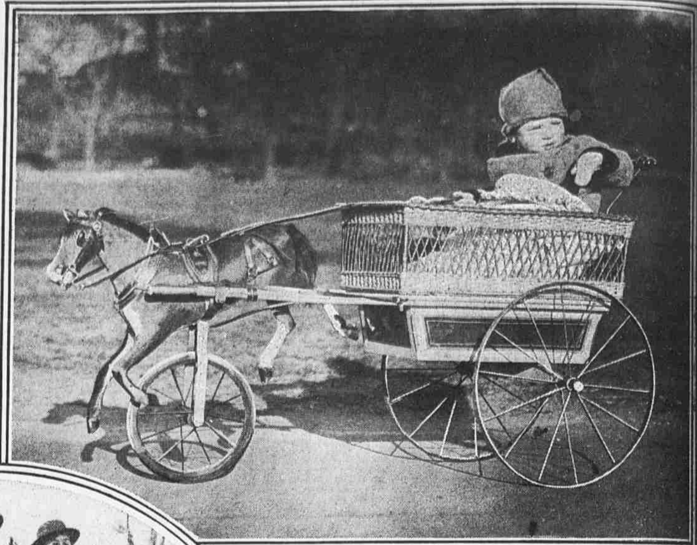
STOPPING HIS OWN CAR TO LOOK OVER THE BIG ONES

Showing that the horse has not yet lost his popularity, since there are still those who prefer his gentle amble to the furious rush of the automobile.