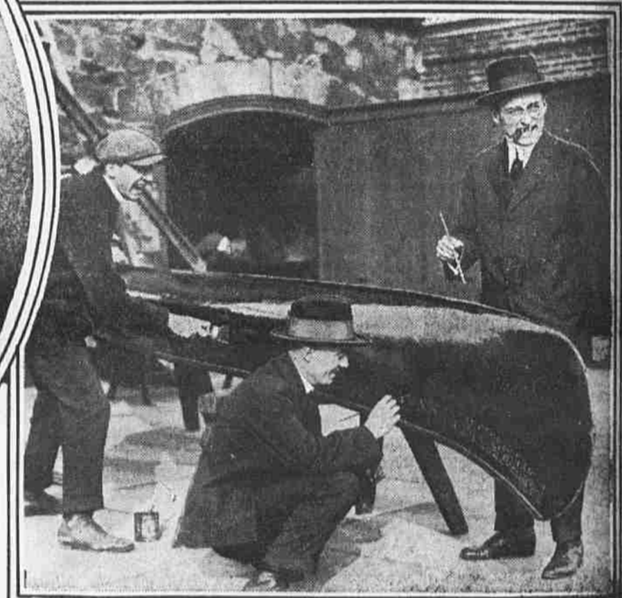
PAINTING HER ANNUAL NEW NAME ON THE OLD CANOE