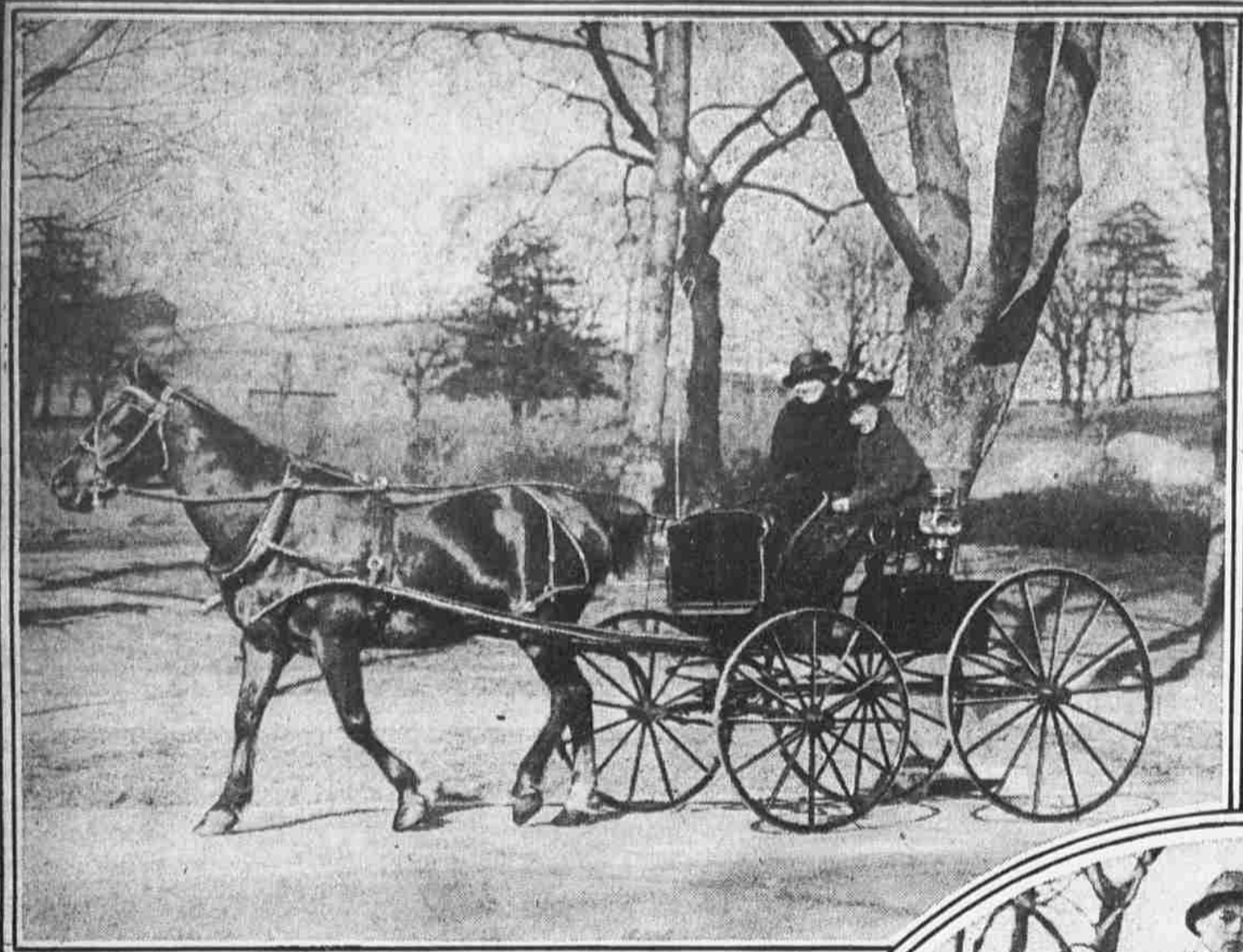
A RUNABOUT DRIVE IN FAIRMOUNT PARK

Showing that the horse has not yet lost his popularity, since there are still those who prefer his gentle amble to the furious rush of the automobile.