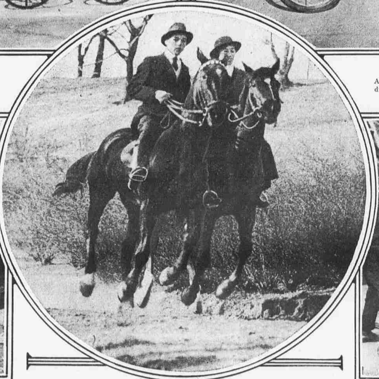
A SPRINGTIME CANTER ALONG THE BRIDLE PATH