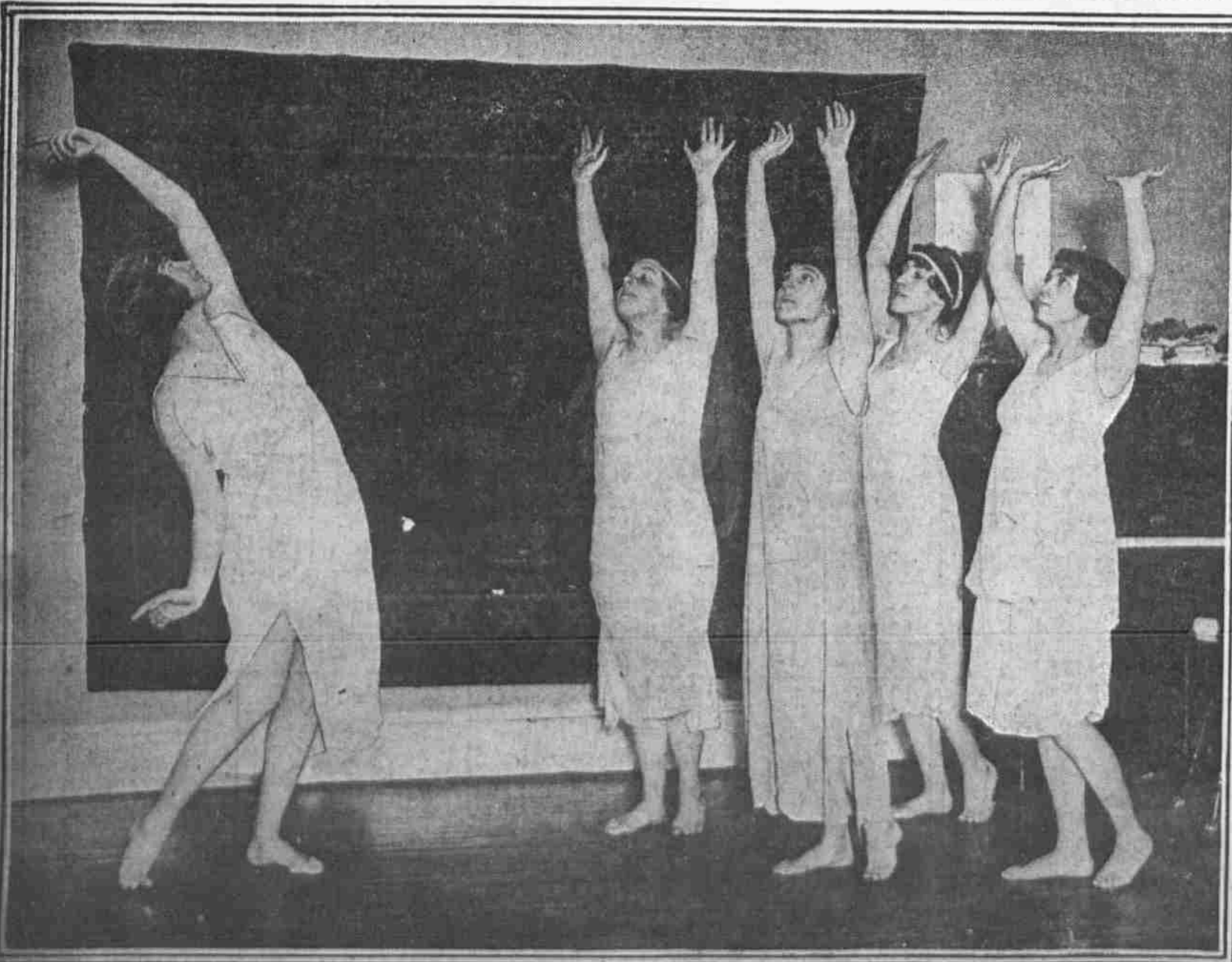
DANCED AT BENEFIT FOR THE BLIND

New Jersey's season opened the first of the month and fair luck is already reported, though the water is still too cold for the best luck. Pennsylvania's season opens on the 15th inst.