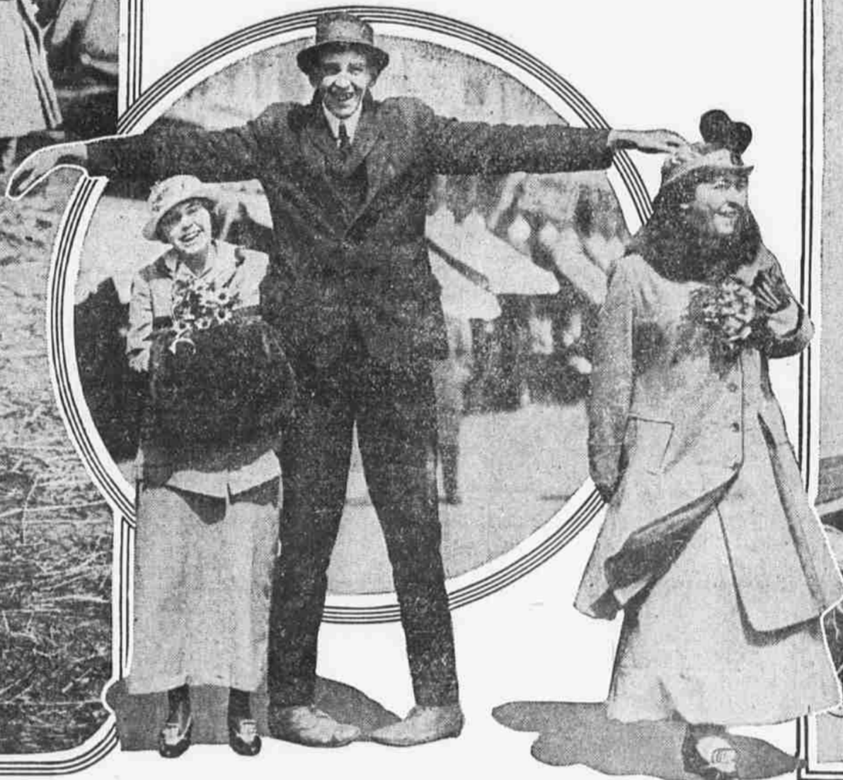
THE TALLEST ROLLING CHAIR PUSHER IN CAPTIVITY

There are ten big passenger vessels in sight here, all belonging to the Hamburg-American Line. An idea of the superiority in size of the great Vaterland may be gained by observing her funnels here, which loom up so as to dwarf those of her companion ships.