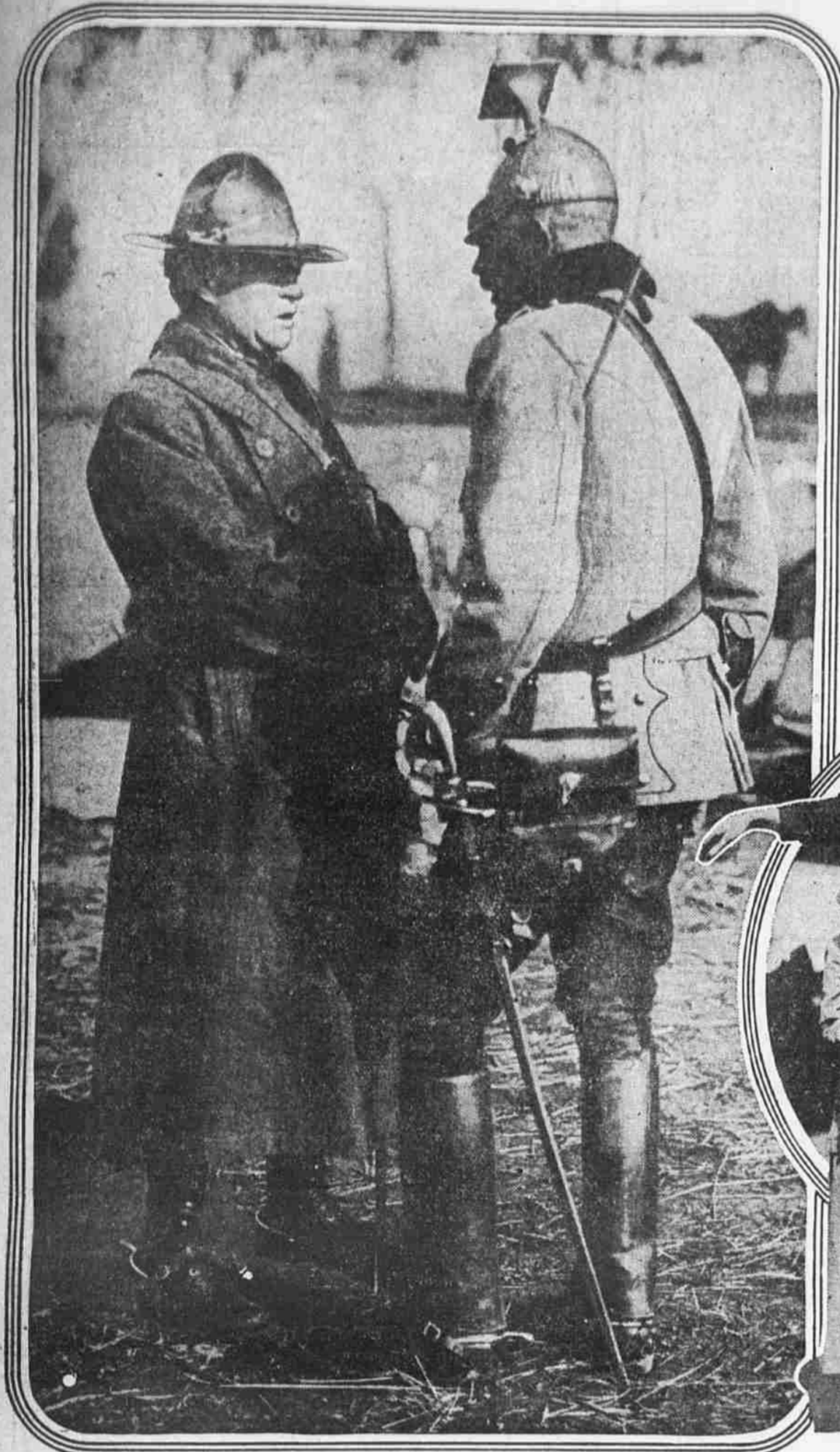
AMERICAN MILITARY ATTACHE AT PRZEMYSL

PERSONS AND SCENES IN DAY'S GRIST OF NEWS FROM HOME AND ABROAD AS CAUGHT BY THE CAMERA