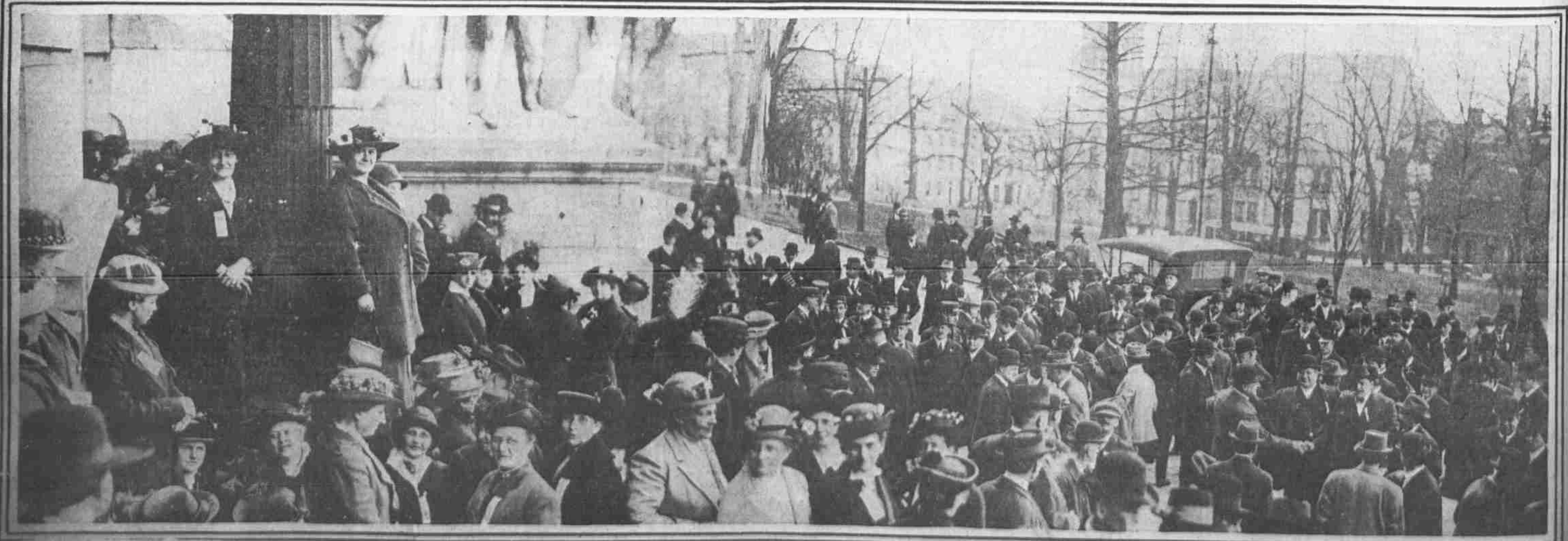
CROWD OF 6000 WHICH GATHERED AROUND STEPS OF CAPITOL AT HARRISBURG YESTERDAY DURING DEMONSTRATIONS FOR AND AGAINST LOCAL OPTION

These pictures, which have just arrived from Germany, show how every opportunity is taken to ridicule the empire's enemies. The three eggs at the right are supposed to represent, in turn, General Joffre, Sir Edward Grey and the Grand Duke Nicholas, head of the Russian army. Then comes a German soldier poking along a captive "Schwein," or British pig, also represented by Easter eggs. On the left are four "hen fruit" made up as caricatures of British, French, Russian and Japanese faces.