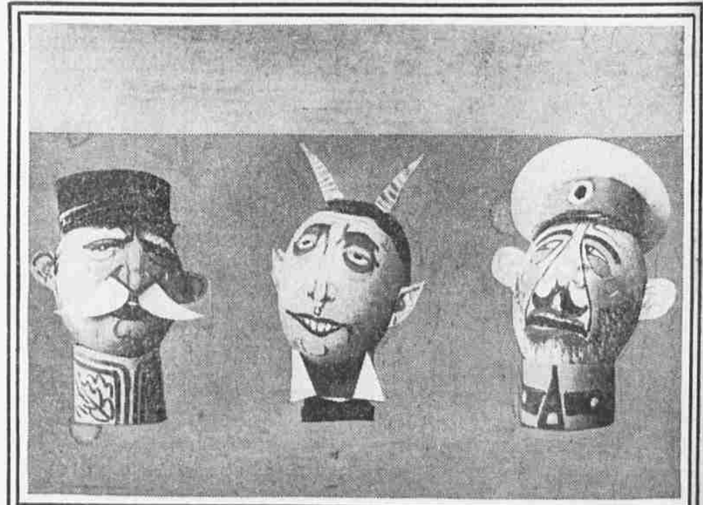
GERMANY'S EASTER FUN IS AIMED AT ALLIES BY CARICATURES PAINTED ON EGGS