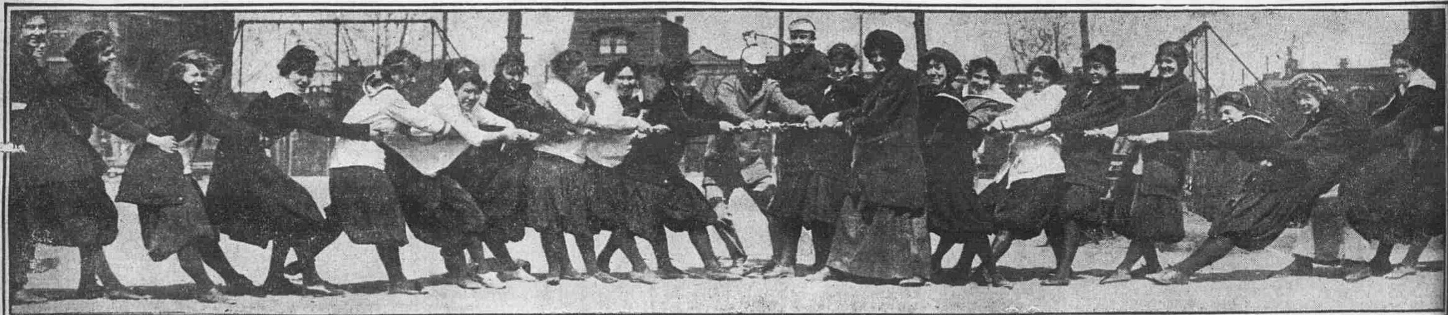
TRAINED FEMININE ATHLETES Who teach the school children of the city how to play, engaging in their own tug-of-war at Athletic Centre, 26th and Jefferson streets.