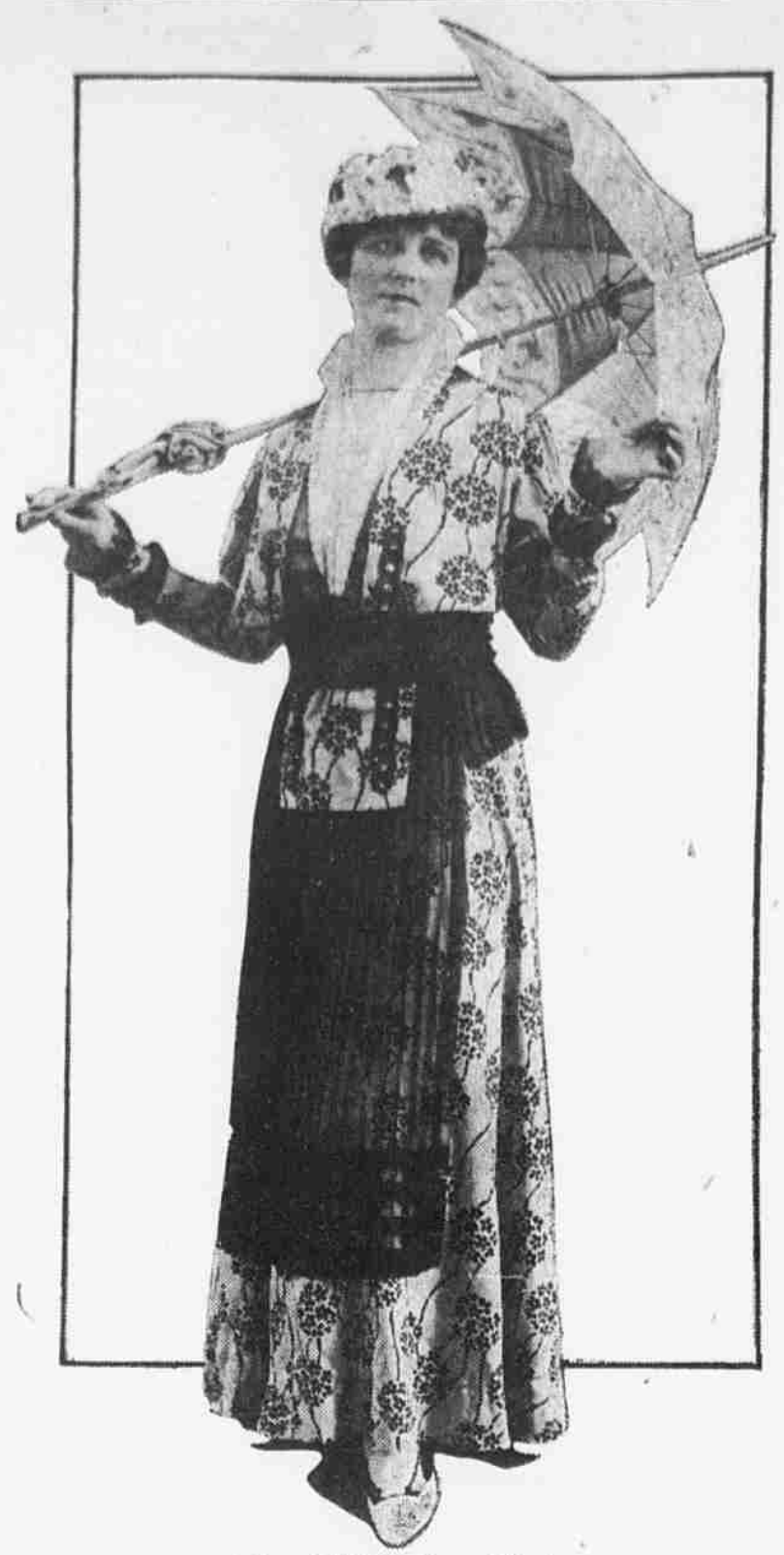
A Gown With the Apron Effect

IT WAS down in one of the fine old-time houses on West 23d street that Joan happened to have taken a room. She had come in from the country to write a column in a city daily called "Chats With the Working Girl," and her advent to the city was fraught with both joy and homesickness.