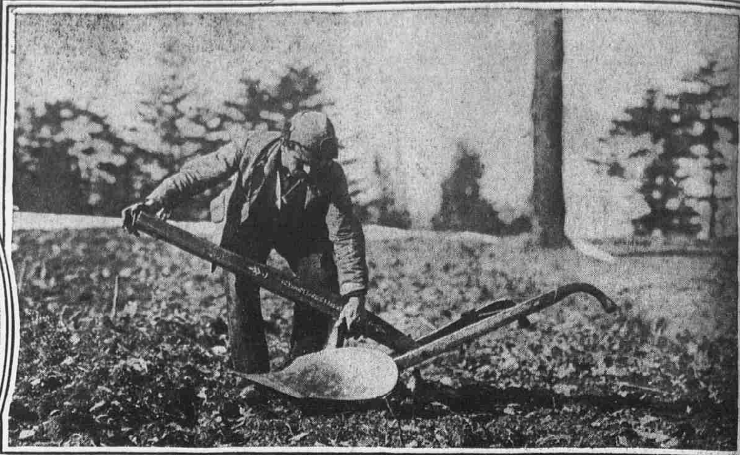
THE PLOWMAN FIELDWARD WENDS HIS WAY As the sun takes on the warmth of a genial spring the earth likewise feels the softening influence, and spring plowing is now the "order of the day" in many sections of Pennsylvania, Delaware and New Jersey.