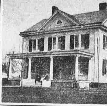
BAKER'S HOME AT TRAPPE MD

goes off on long trips, thinks it would be a shame for him to retire when he is so young and just at the height of his career. After having put Trappe on the map, its 450 inhabitants think it's more or less Baker's duty to keep it there.