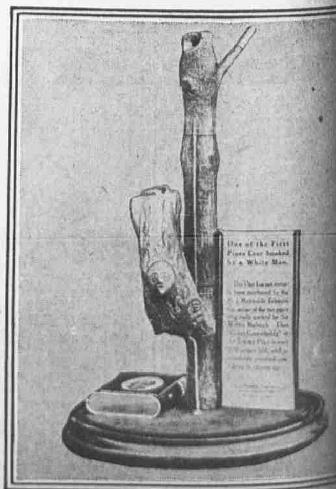
THE DADDY OF THE MODERN PIPE