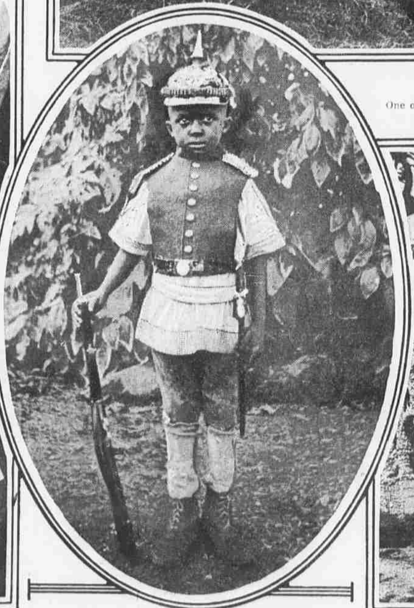
LOYAL SUBJECT OF THE KAISER A pikaninny inhabitant of German West Africa in the uniform beloved of his Emperor.