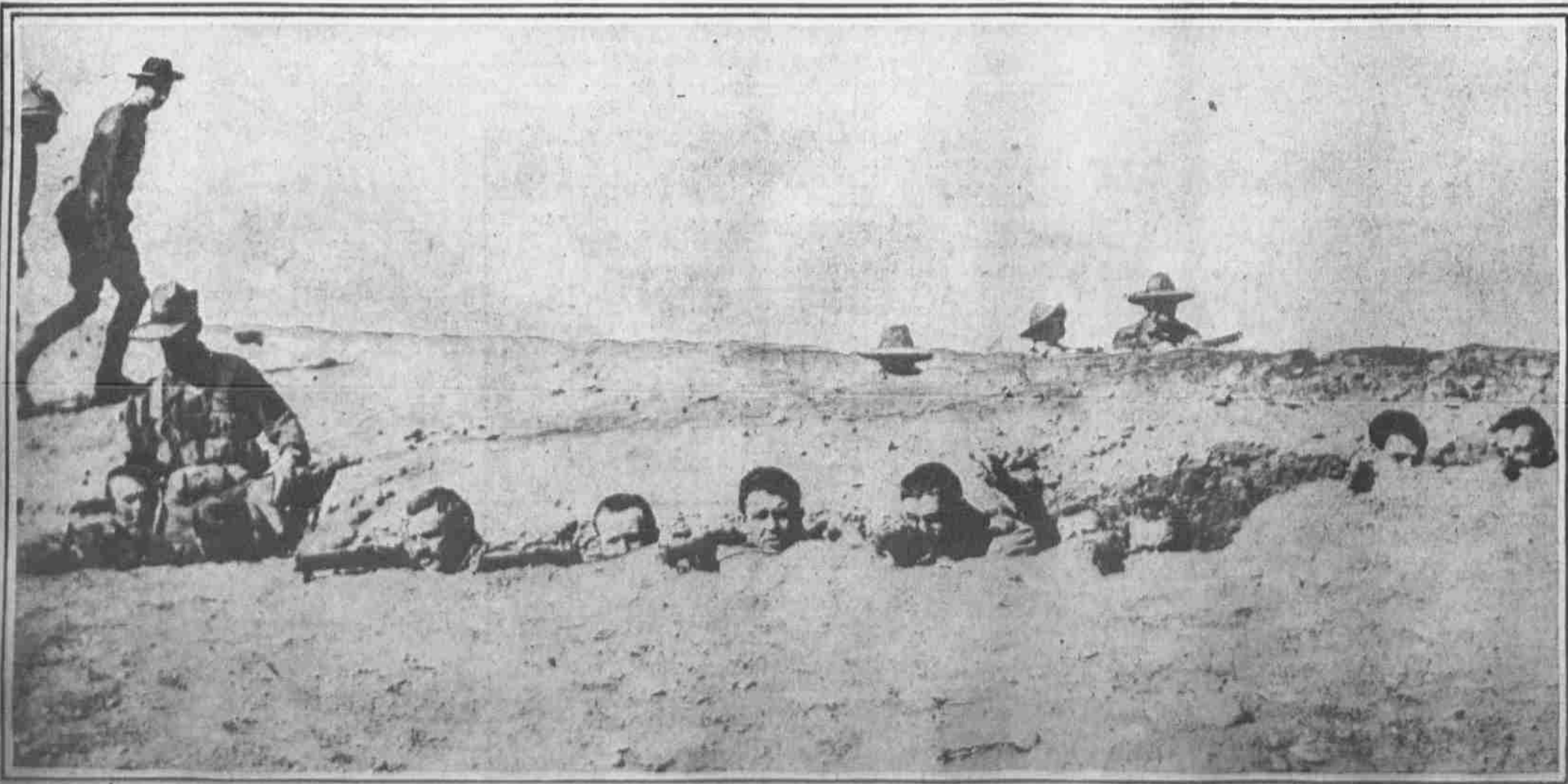
INTRENCHED IN THE DESERT'S BURNING SANDS Australian troops, who were diverted to Egypt at the time of the threatened rebellion there, have prepared against invasion by the Turks by miles of rifle trenches. The photograph shows the works in process of construction, only the tops of the men's heads being now visible.