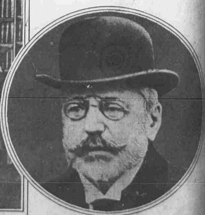
NEW AUSTRIAN FOREIGN MINISTER Baron Burian has a heavy load to carry in his new capacity. It is asserted that his appointment was caused by the ill feeling in Hungary against the Austrian conduct of the war. The Baron, being Hungarian, appeased the feelings of his countrymen and obtained better organization of the defense against Russia.