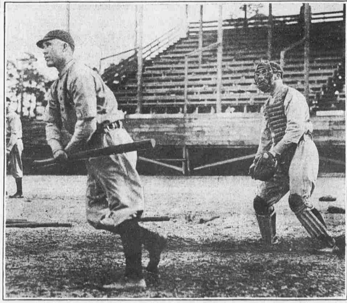
KILLEFER TAKES CARE OF THOSE THAT ADAMS MISSES