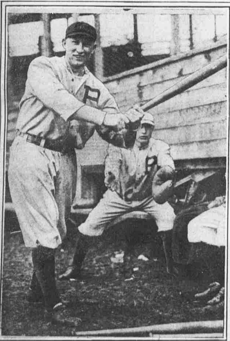
LUDERUS WIELDS THE WILLOW