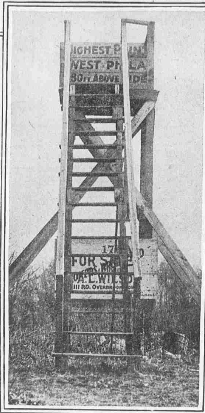
HIGHEST POINT IN WEST PHILADELPHIA AND WHAT YOU SEE FROM THERE This old wooden observation platform is on the city line about midway between Overbrook and Bala and, as the inscription testifies, is 380 feet above tidewater. The view from it, shown above, gives one a good idea of the rolling country in which most of Philadelphia's suburbs are situated.