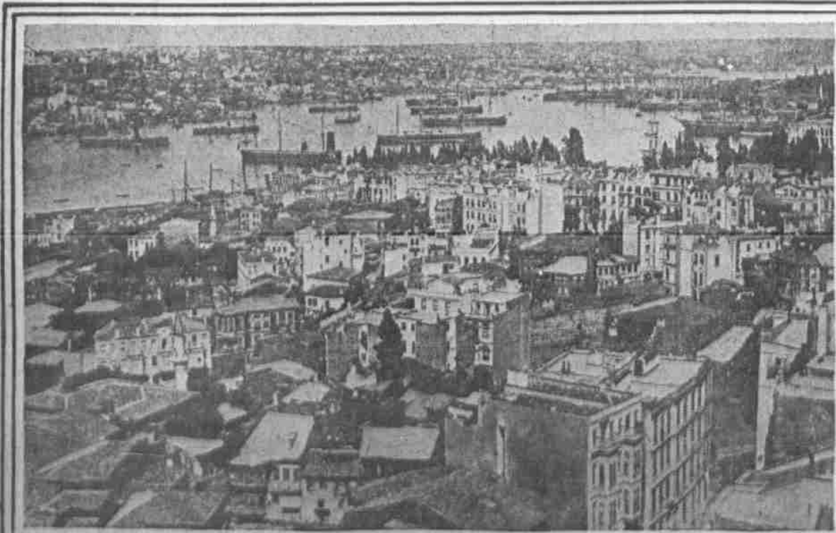
MENACED BY THE GREAT ALLIED FLEET Turkish fleet at anchor in the Bosphorus opposite Constantinople, whose flat roof tops and minarets are huddled close together as if seeking protection from the looming 15-inch guns now not far off. This may soon become the scene of the greatest naval battle of the present war.