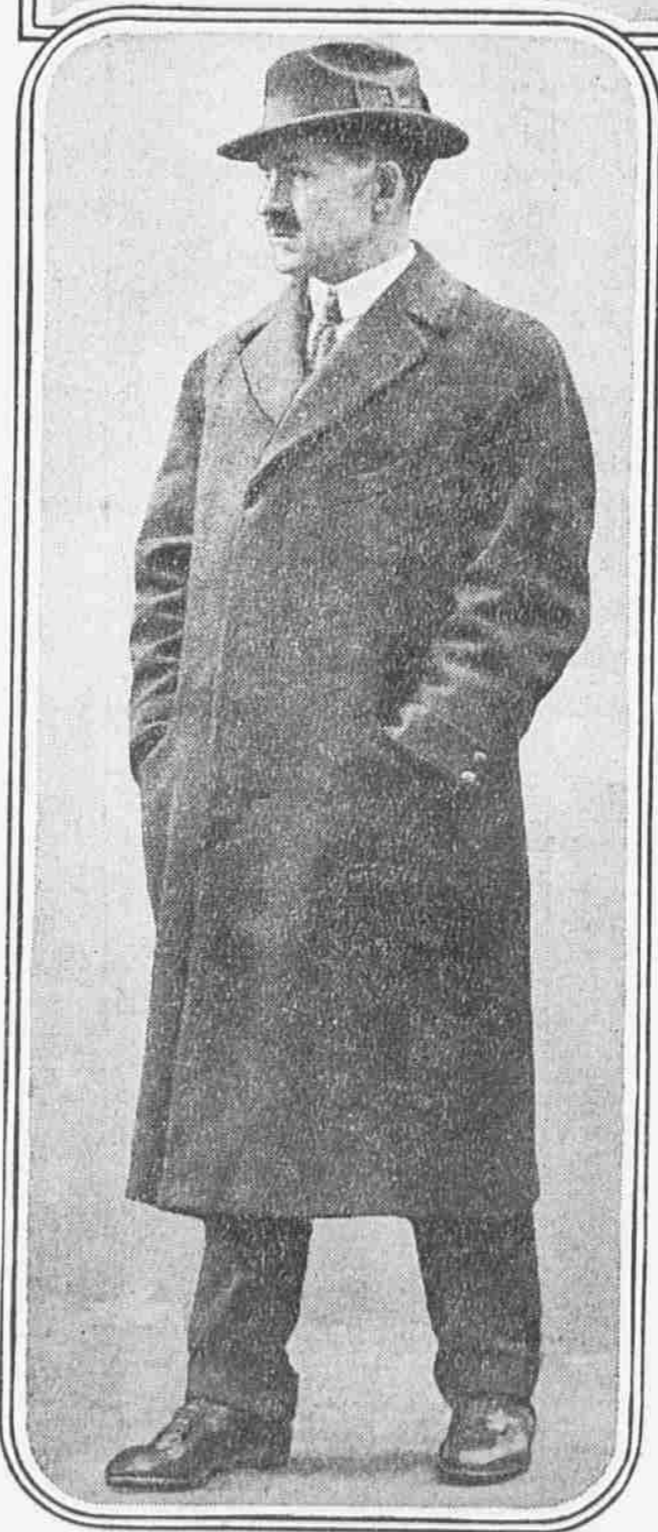
A MAN OF MYSTERY Everybody knows his face, but few know his name. It is his habit to slip softly up to the Chestnut street pedestrian and, in a stage whisper, ask: "Got any old clothes you wanna sell?"

A quaint sight found in Chestnut street. Inscriptions on the side of the wagon informed curious passersby that the owner was on his way from Staten Island to the Golden Gate. The picture of the schooner's pilot is a typically American one, with his thin nose and high cheek bones. It's easy to guess he will "git thar."