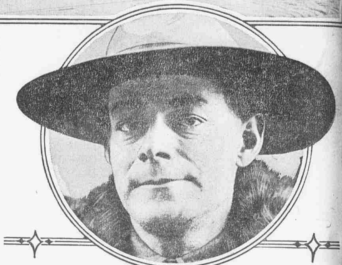
OLD-TIME PRAIRIE SCHOONER BOUND FOR 'FRISCO AND ITS PILOT

A quaint sight found in Chestnut street. Inscriptions on the side of the wagon informed curious passersby that the owner was on his way from Staten Island to the Golden Gate. The picture of the schooner's pilot is a typically American one, with his thin nose and high cheek bones. It's easy to guess he will "git thar."