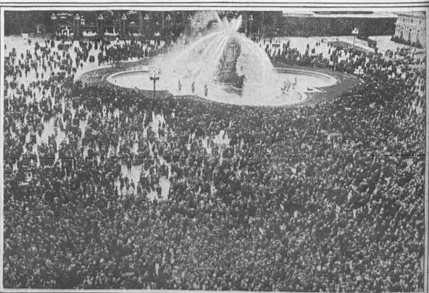
300,000 ATTEND OPENING DAY AT THE PANAMA-PACIFIC EXPOSITION One of the greatest throngs that ever gathered in one place in the United States waited at the entrance gates of the Exposition until President Wilson pressed a button in Washington, releasing the pent up waters in the Fountain of Energy, shown above, and formally starting the ceremonies. The buildings here belong to the Court of Jewels.