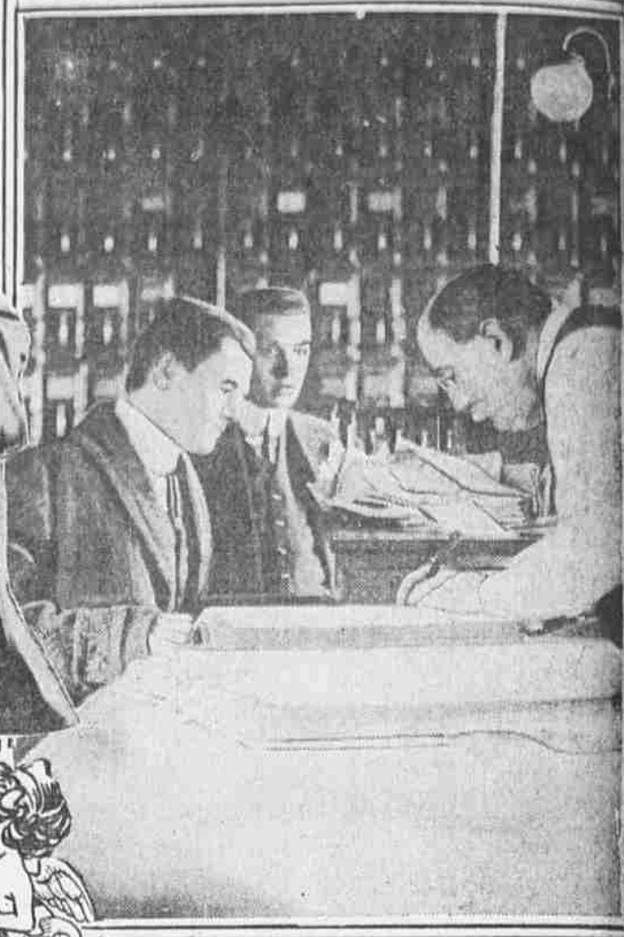
THE LICENSE CLERK IS SYMPATHETIC He has done this many a time before and it is the work of but a few moments to obtain the document.