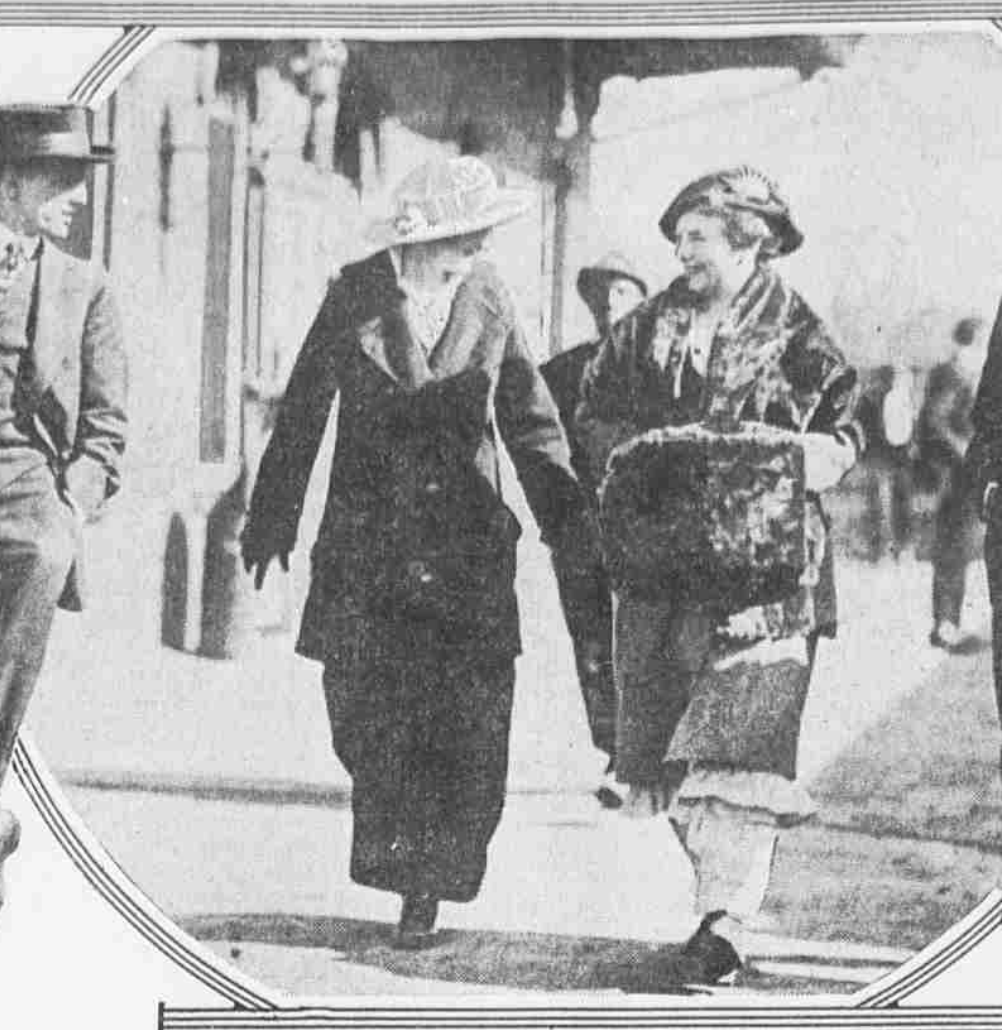
A QUARTET ON MATRIMONY BENT When facing an ordeal, it always makes things easier to find there are others in the same fix. Here are two couples who have discovered they have a common purpose and are smiling upon each other encouragingly as they start for Cupid's altar.