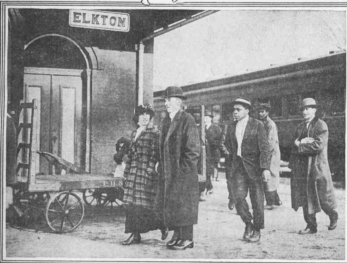
ELKTON, THE WORD THAT MARKS THE JOURNEY'S END That sign on the station building doubtless has caused an extra thump in the tremulous hearts of many a prospective bride and bridegroom. Too late to back out now, though parental wrath be waiting back home.