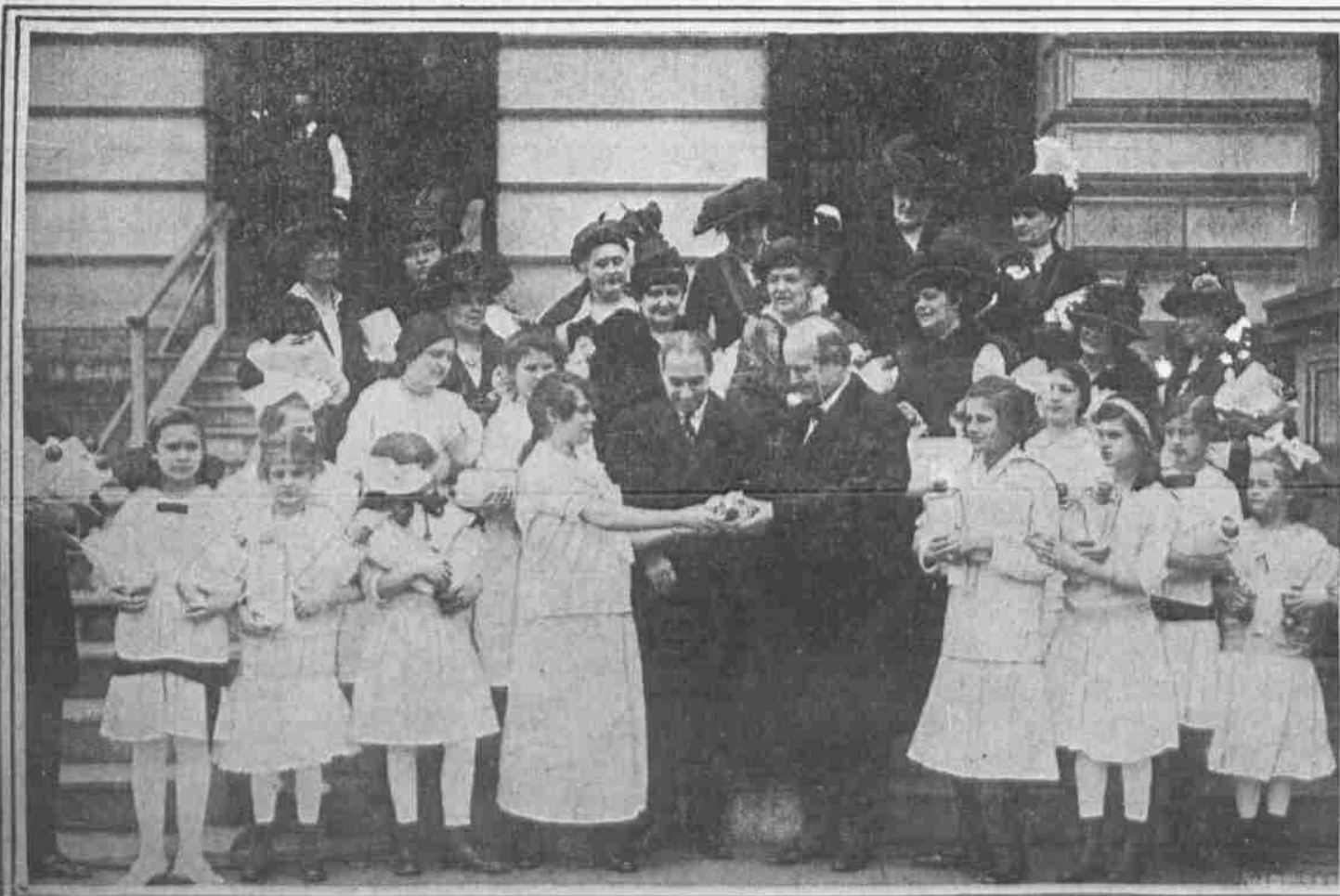
BRYAN RECEIVES THREE-MILE PEACE PETITION FROM CHILDREN School pupils from 45 States of the Union to the number of 350,000 signed the petition addressed to the rulers of the Warring Powers which was presented to the Secretary of State by 12 little girls from the Washington public schools. The names attached measured almost three miles in length. With Secretary Bryan in the picture is Senator R. B. Nason, Ambassador from the Argentine Republic.