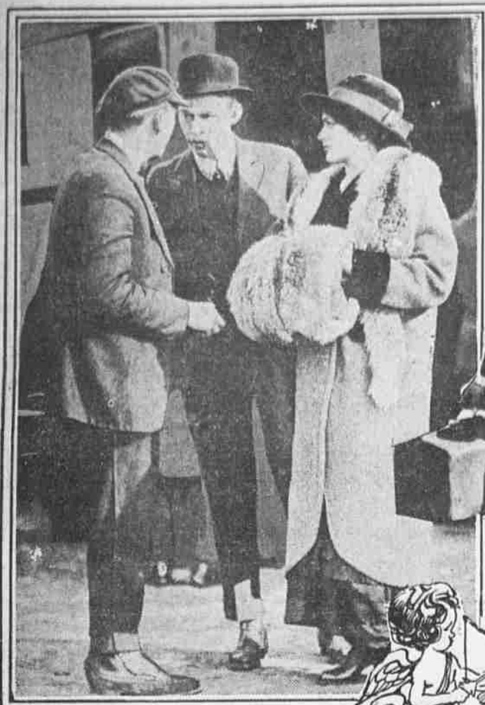
JUST OFF THE 9 O'CLOCK MARRIAGE SPECIAL The first thing to do on arriving at the Maryland Getna Green, of course, is to bargain with a chauffeur or cabby.

A TRIP TO ELKTON, WHERE THE BRIDES COME FROM, IS RECORDED BY A STAFF PHOTOGRAPHER