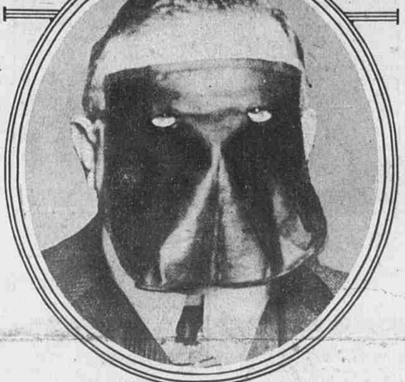
This was the sight that met the eyes of the prisoners lined up before the city's detective force today in order that the sleuths might familiarize themselves with the features of suspects.

Germany will not be held to "strict accountability" for destruction of the American steamship Evelyn at Borkum.