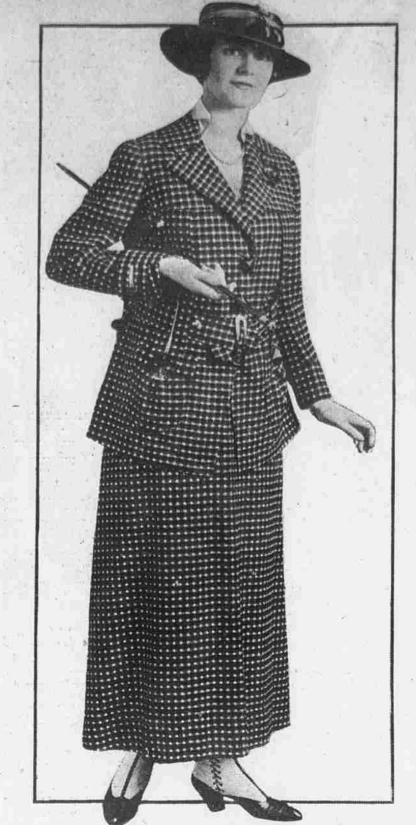
AN ATTRACTIVE NEW SPRING STYLE

Magistrate Advises "Billy" Sunday Treatment for Woman. The "Billy" Sunday tabernacle as a more effective cure for habitual drunkenness than the House of Correction was advocated by Magistrate Knealy.