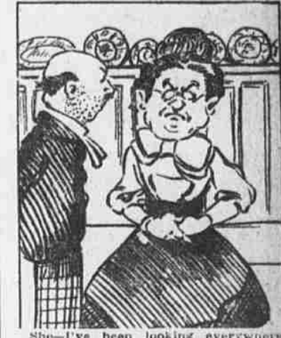
She-I've been looking of for our marriage certificate. He-What's wrong? Isn't the future