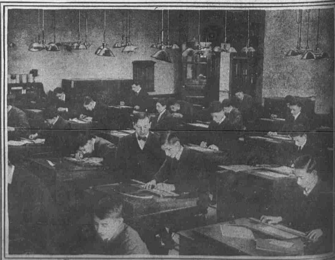
BOYS LEARN TO USE THEIR HANDS AS WELL AS THEIR HEADS AT THE SOUTHERN HIGH SCHOOL. A corner of the machine shop where the making as well as the use of tools is taught. Future builders of great cities at work at their desks in the architecture class.