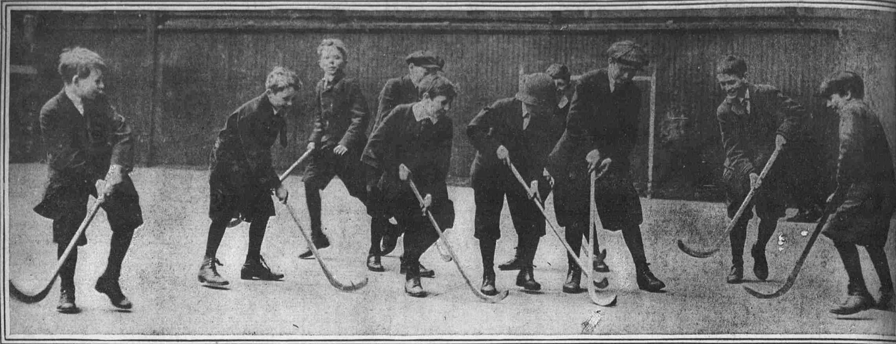
SHINNEY DEVELOPS THE SOUND BODY FOR THE SOUND MIND WHICH IS CULTIVATED AT THE EPISCOPAL ACADEMY