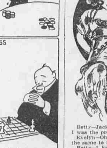
"Is he? He can't go out of the house without running down the street." Naturally