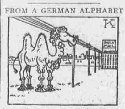
-Lustige Blactter infamous Daily "Kables"; None but a "Kamel" could relish such fables.

A TRUE DIARY BY A BOY) AGAIN AT NOON WE HAD A SNOW BATTLE WITH THE HIGH SCHOOL, WE FIRED ON THEM AS THEY WALKED DOWN THE HILL AT THE BOTTOM OF THE HILL THEY MADE SNOWBALLS AND BEGUN THE ATTACK. OUR 1000 TO THEIR 4-0, WELL THEY FOUGHT THEIR WAY TO THE TOP OF THE HILL AND FIRED HARD AND FAST AROUND THE SCHOOL BUT I RAN TO THE FRONT WITH THE REST, I HIT ONE FELLOW BUT WASN'T HIT MYSELF. THEY WON WITH JLARGER AND STRONGER HAPPENED TODAY FOR ME. I'M NEARLY THRO' WITH CAPTAIN HORN'" (A TRUE DIARY BY A BOY)