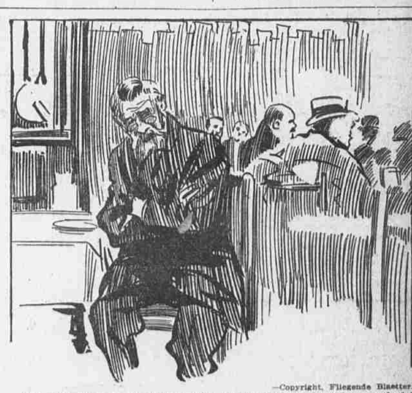
The Pessimist in the Restaurant-The automatic plano-player is a wonderful invention. For a nickel you can make 50 people miserable.

Small boy-Good fishin'? Yesair. Ye go down that private road till ye come to th' sign, "Trespassers Will Be Prose-cuted," cross the field with th' bull in it an' you'll see a sign, "No Fishing Alowed"-that's it.-Life.