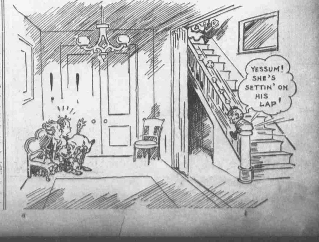
GRANDMA, THE DEMON CHAPERON, DIDN'T HAVE TO BRIBE WILLIE TO HELP HER BECAUSE THE SLIDE PART APPEALED TO HIM. YESSUM! SHE'S SETTIN' ON HIS LAP!