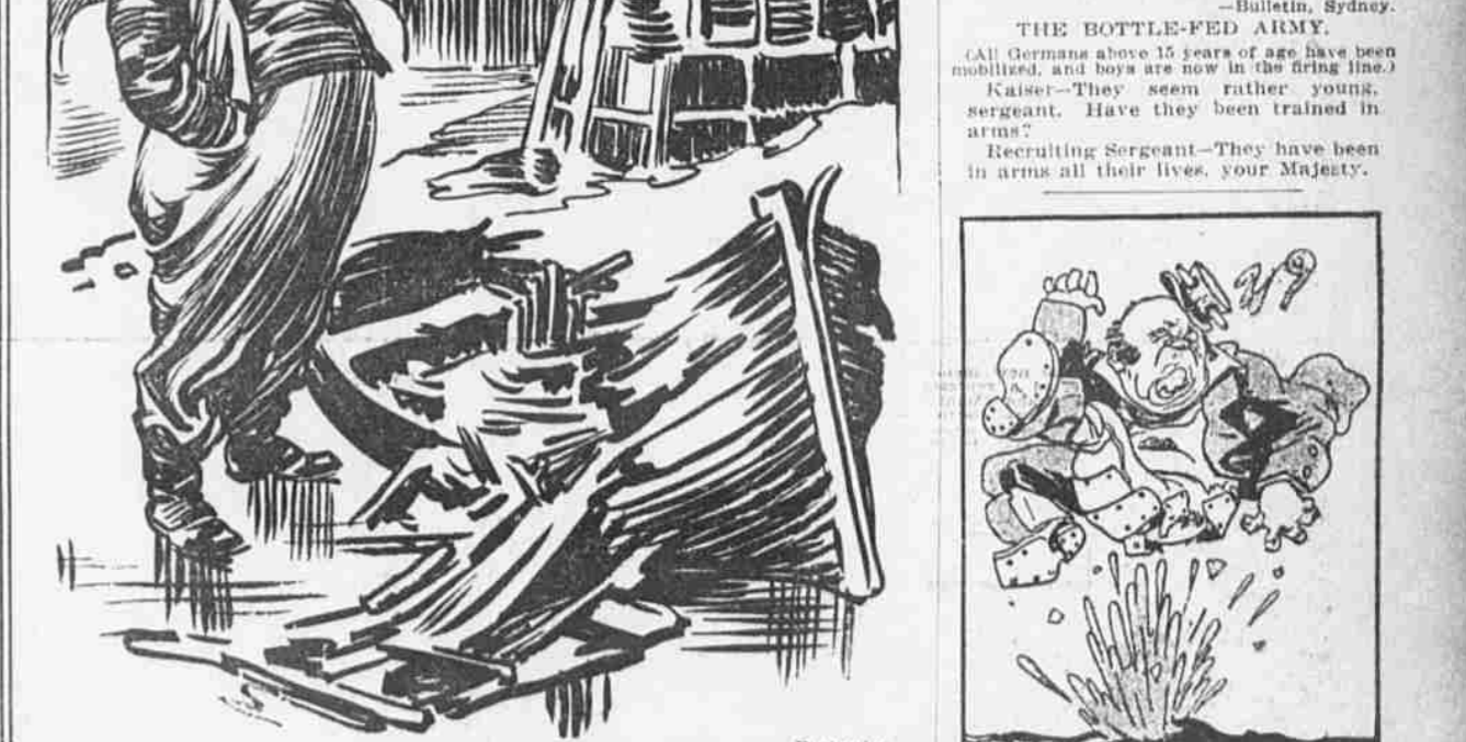
THE BOTTLE-FED ARMY. (All German above 15 years of age have been mobilized, and boys are now in the firing line.) Kaiser - They seem rather young, sergeant. Have they been trained in arms? Recruiting Sergeant - They have been in arms all their lives, your Majesty.