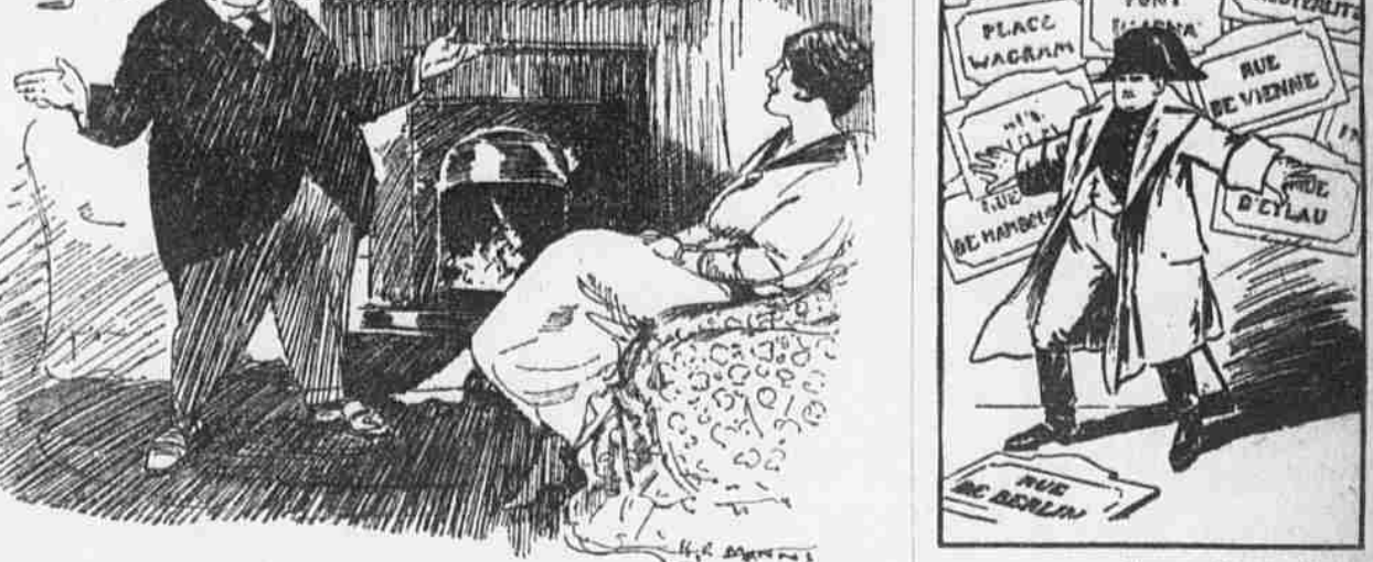
Husband-and pray, why shouldn't I join some force for the defense of my country? I must be of some use.