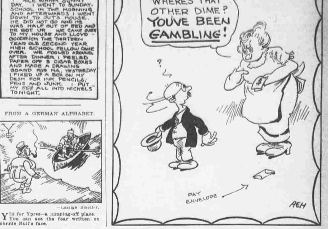
FROM A GERMAN ALPHABET.