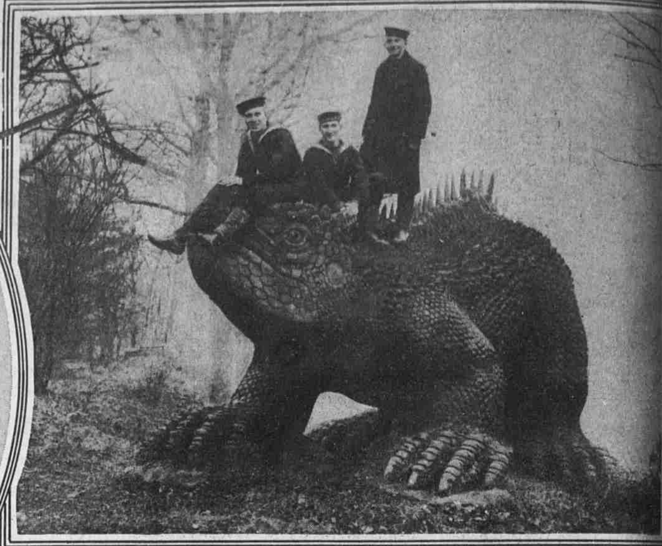
CARRYING AN UNACCUSTOMED LOAD This might be a picture of British fighting men subduing the German monster of militarism. As a matter of fact, it is a behemoth constructed for the amusement of children at Crystal Palace, London's Willow Grove Park, now a training ground for England's naval recruits.