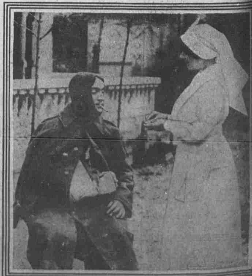
A PHILADELPHIA WOMAN AT THE WAR FRONT This photograph has just been received from France, with the announcement that it is a Philadelphia woman married to an English nobleman, who is serving in the Anglo-American Hospital at Wimereux, France.