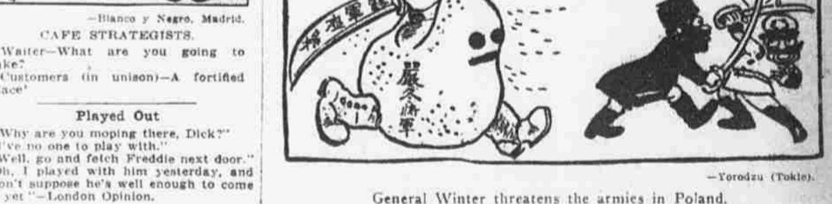
A JAPANESE CARTOON. General Winter threatens the armies in Poland.