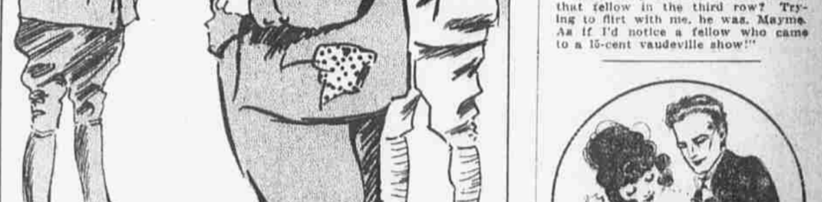
PROOF POSITIVE. The Captor, to His Superior Officer-Found 'im sittin' on a barrel of lager beer, eatin' sausage like a pig, an' 'e said 'w was a Chinaman.