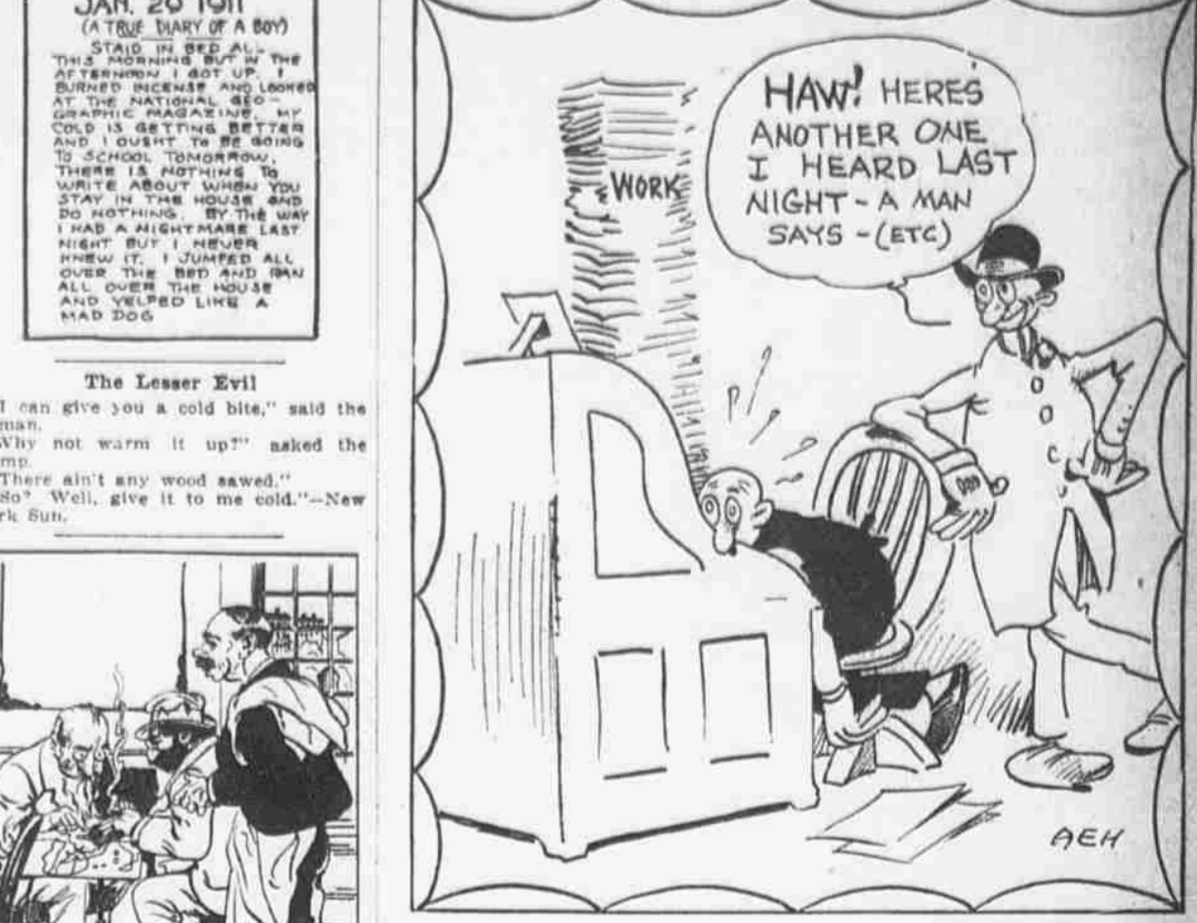
THE PADDED CELL. "HAW! HERES ANOTHER ONE I HEARD LAST NIGHT - A MAN SAYS - (ETC) WORK"