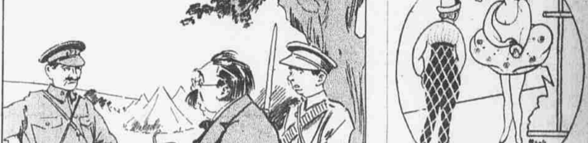
SO HEAVY. Admirer-My dear, the world was but a desert to me before I met you. She-I can readily believe it, because you dance like a camel!