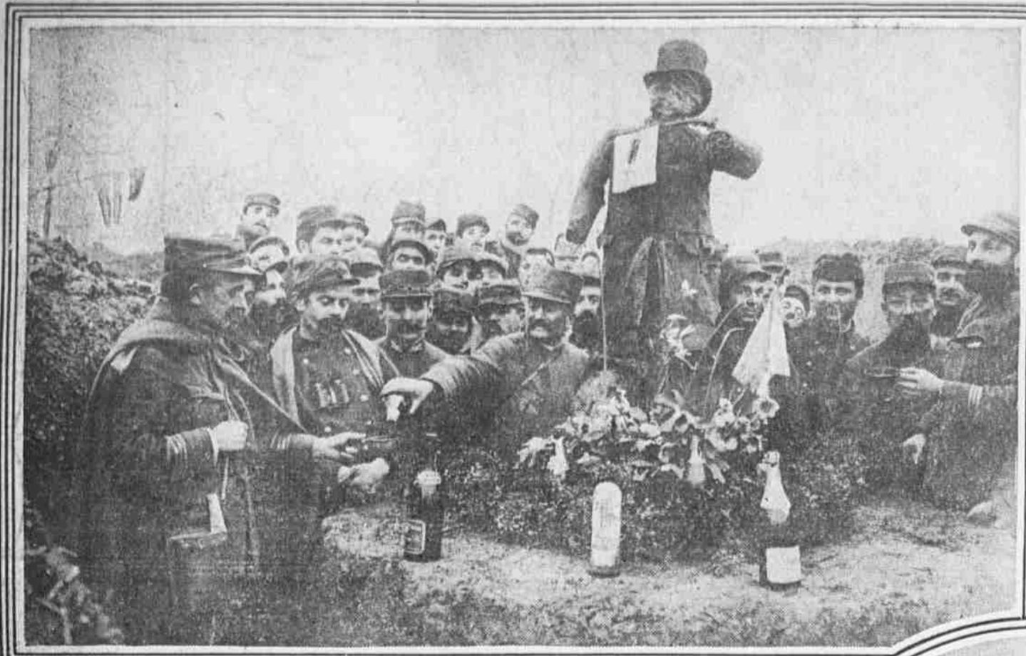
FRENCH SOLDIERS GIVE GERMAN DIPLOMAT THE IRON CROSS

These troopers in Alsace, being well protected by their trenches, decided to give the enemy something to shoot at and so rigged up this dummy, which they duly decorated with a cross taken from a prisoner. It has been riddled with German bullets.