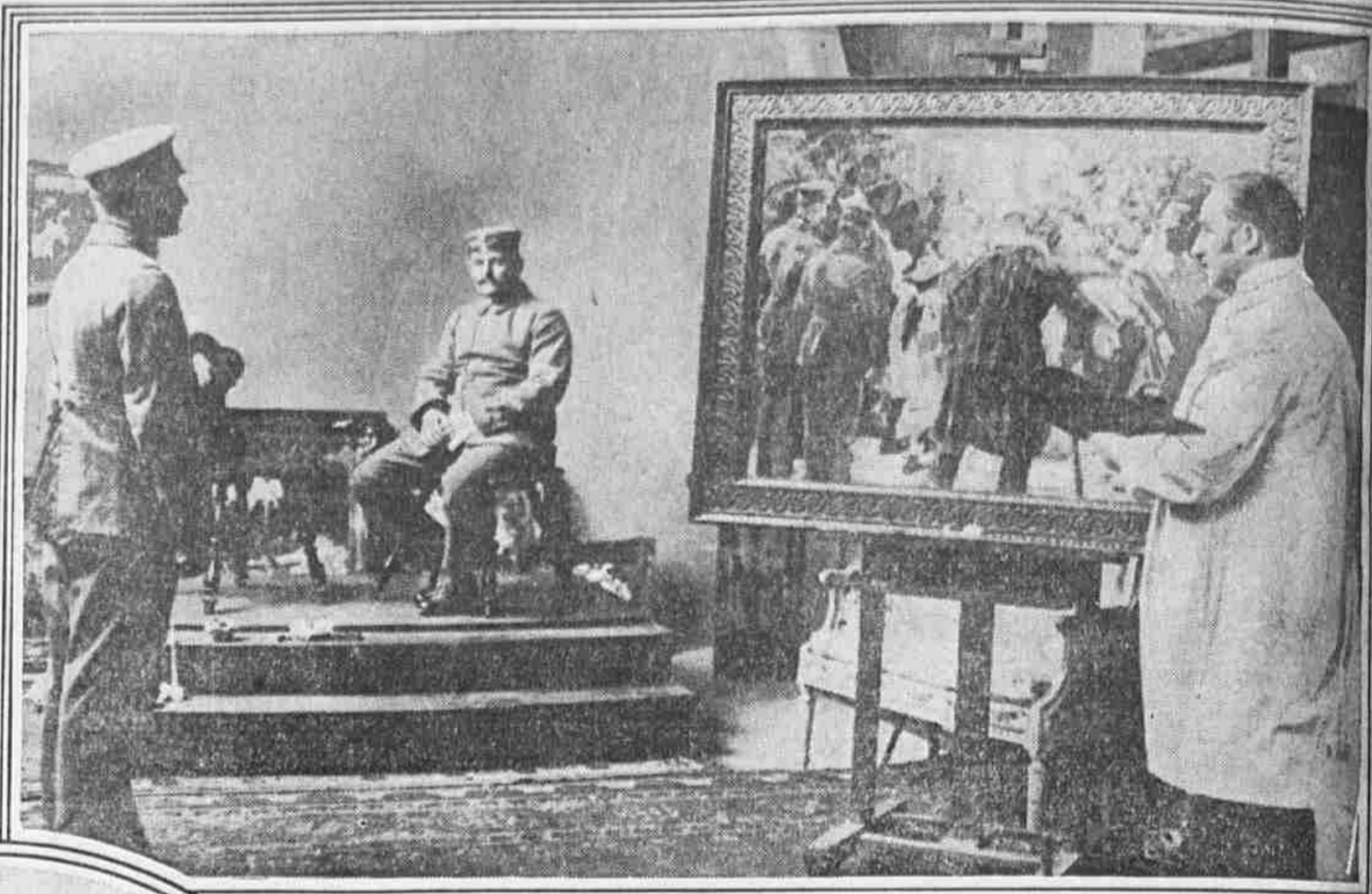
THE PAINTER NOW PRODUCES HIS WAR-PORTRAYING BRUSH

These troopers in Alsace, being well protected by their trenches, decided to give the enemy something to shoot at and so rigged up this dummy, which they duly decorated with a cross taken from a prisoner. It has been riddled with German bullets.