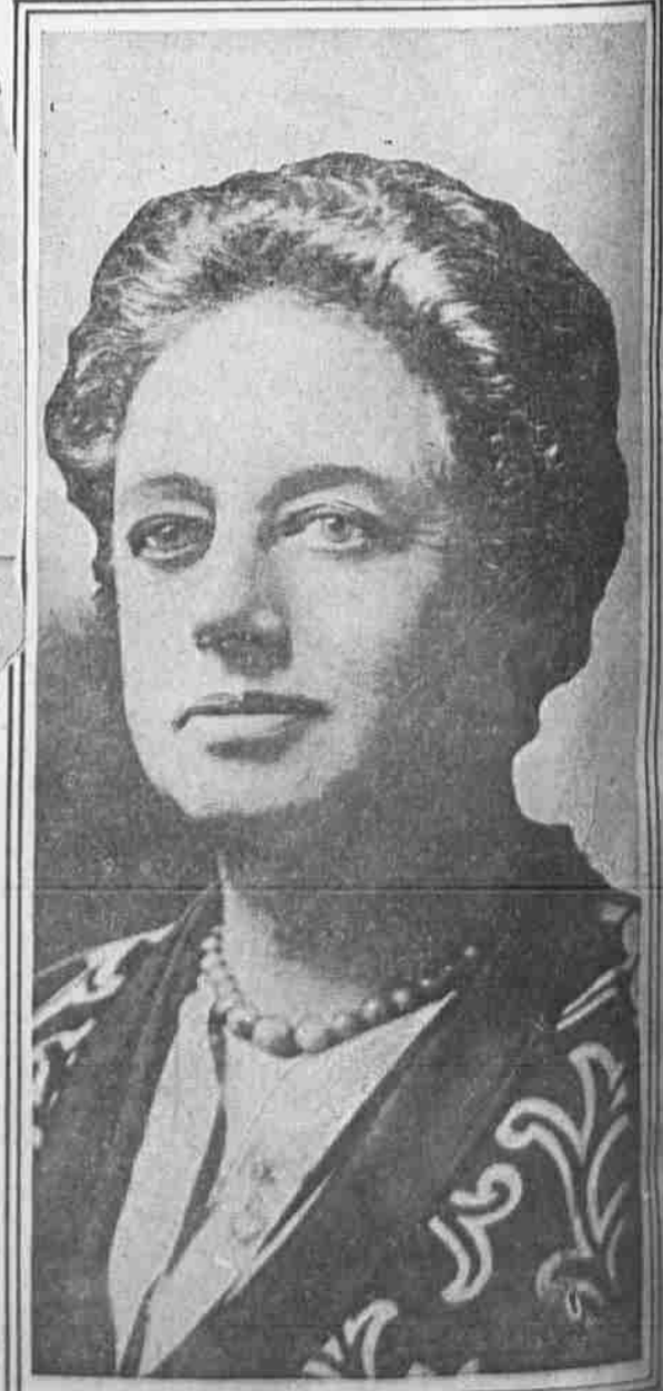
MRS. HAVELOCK ELLIS

Wife of the English scientist and writer, and herself an author of note. She is in this country to study social conditions.