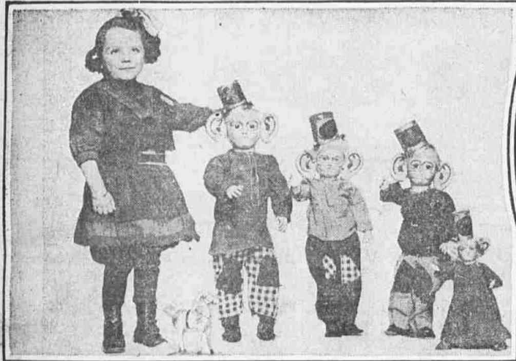
SHE WON THREE PRIZES WITH THESE DOLLS