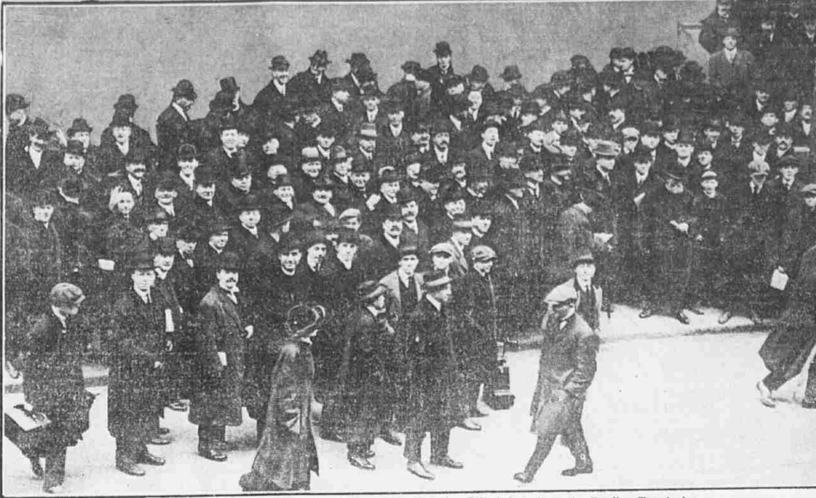
The picture shows the committee of ministers just after they left their train at the Reading Terminal.