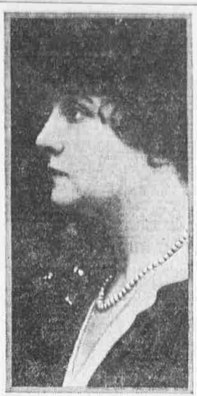
LAURA HOPE CREWS At the Broad in "The Phantom Rival."