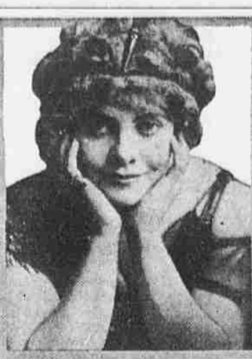
MYRTLE STEDMAN A Bosworth film favorite.