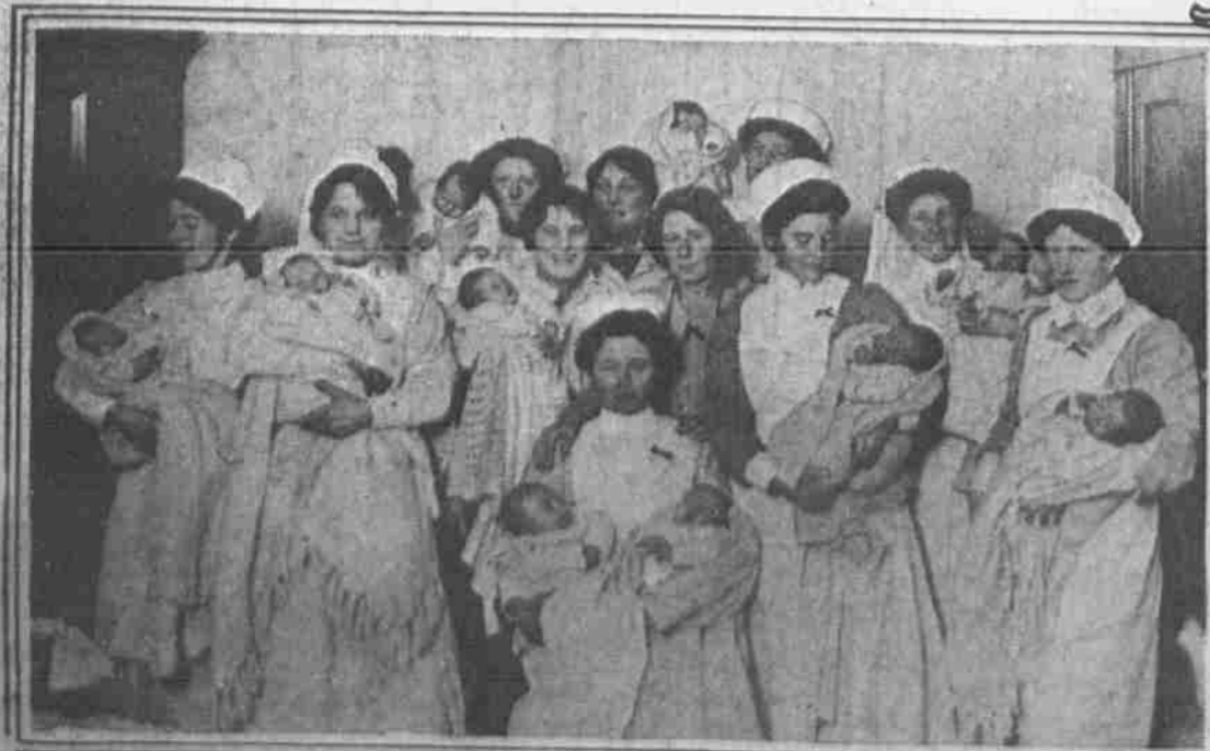
ENGLAND CARES FOR BELGIUM'S CROP OF WAR BABIES These youngsters are the offspring of refugees who fled from the German invasion. Some of them were born in mid-channel as thousands crowded the boats that left Antwerp and Ostend by hundreds. The fathers of several of them were killed in early battles.