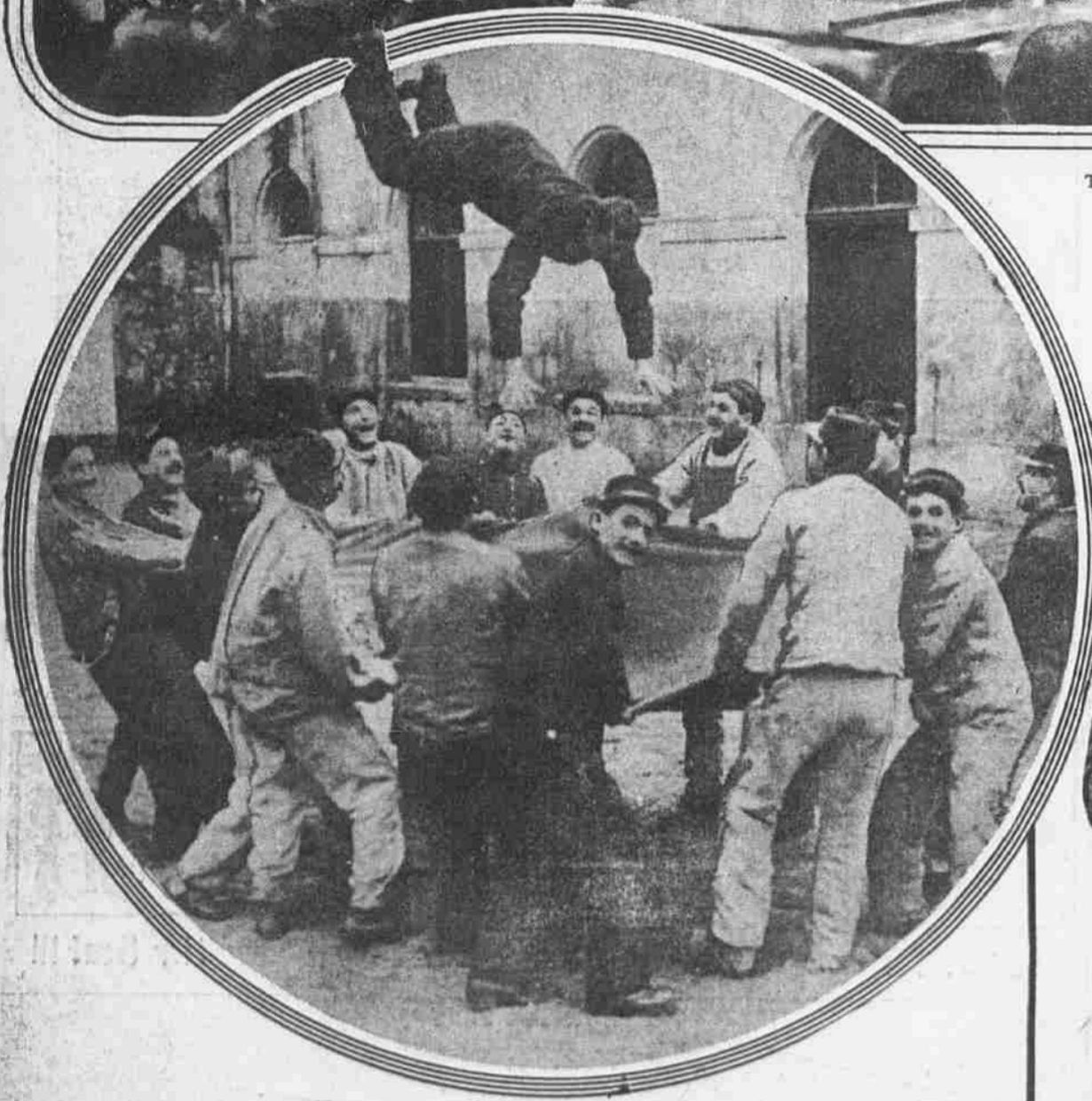
FRENCH SOLDIERS LIGHTEN TASKS WITH A LITTLE BLANKET TOSSING This is one of the oldest sports known to military camps—initiating a recruit by forcing him to do the spread-eagle while a dozen eager hands wield the springy blanket. And the game never seems to grow stale from repetition.