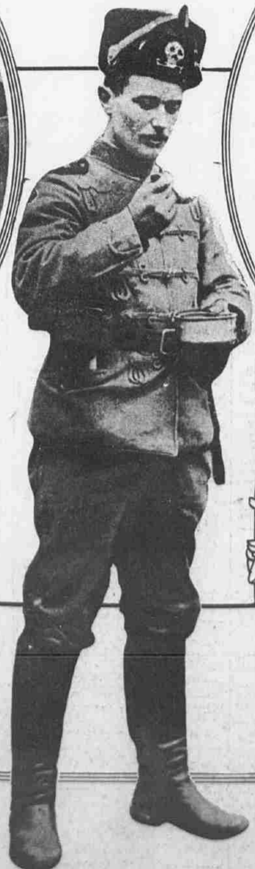
GERMAN DEATH'S HEAD HUSSAR A typical member of the crack regiment made famous by the Crown Prince's connection with it and by the white skull that decorates the fur busby.