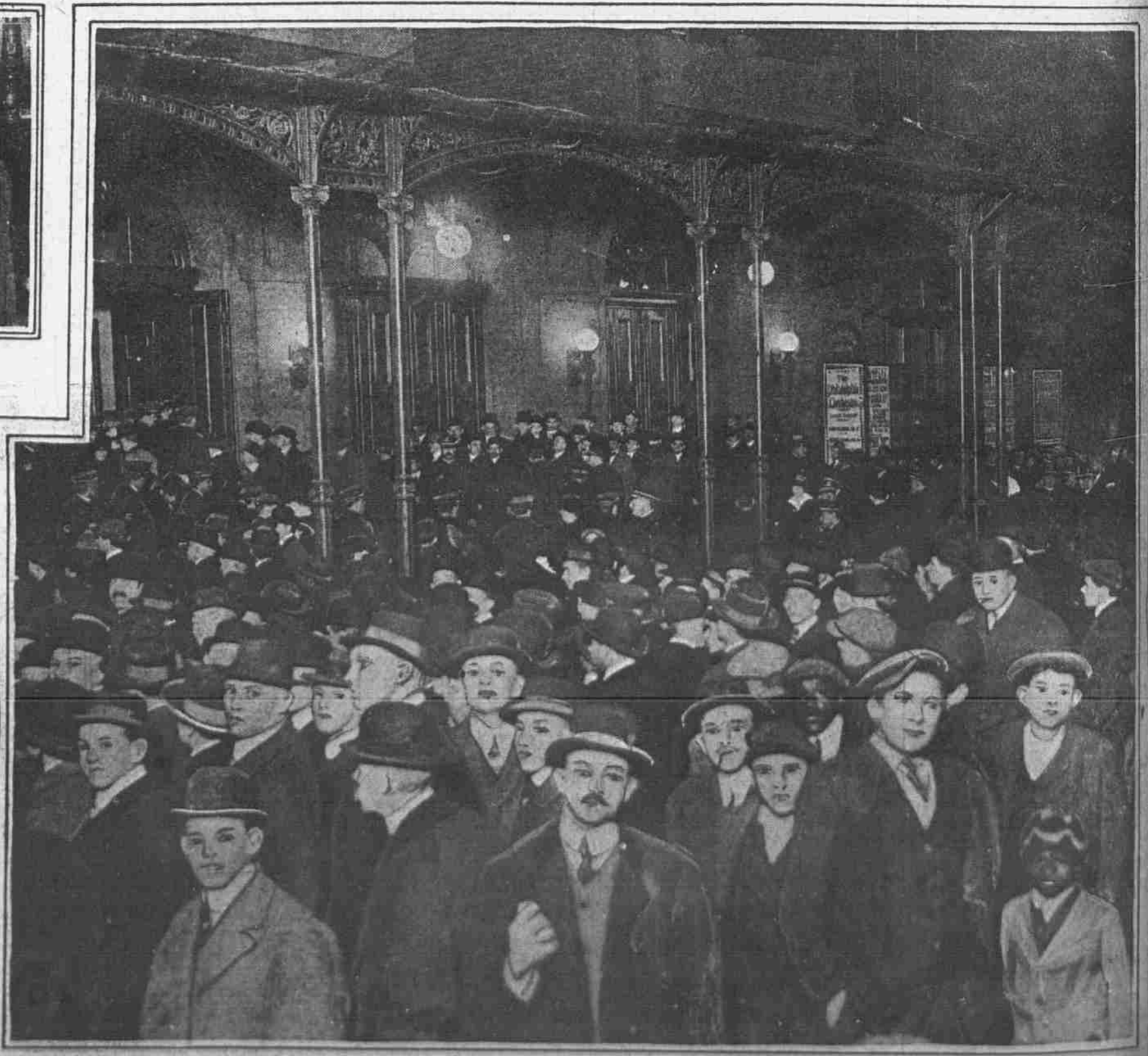
OVERFLOW THROUG MASSED IN FRONT OF ACADEMY OF MUSIC AND SEEKING ADMITTANCE IN VAIN