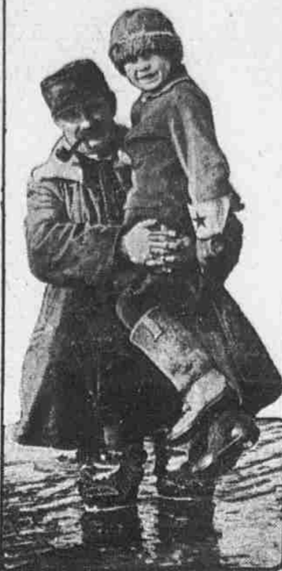
Lightweight passengers could be ferried across submerged streets by arm and shoulder service at Gloucester.