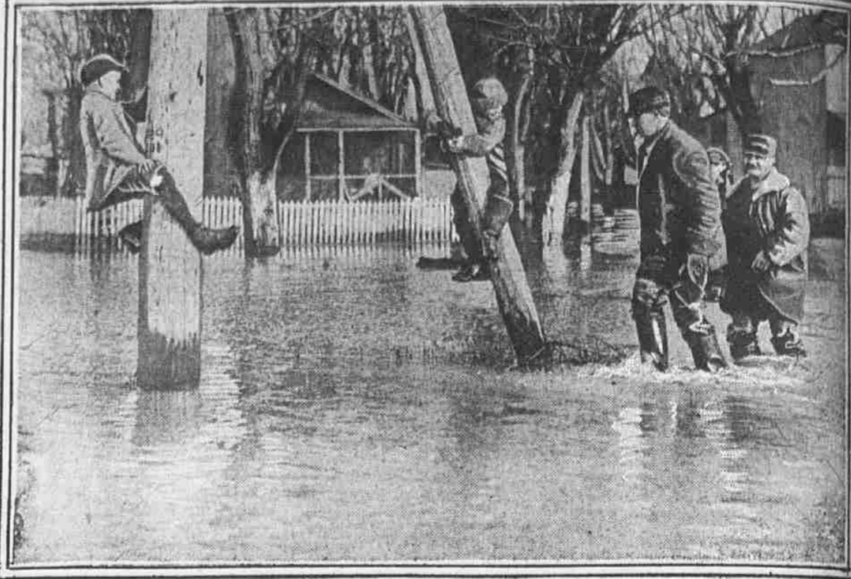
THEY TOOK TO TREES AND POLES TO ESCAPE FLOOD AT GLOUCESTER The Jersey town was taken by surprise when the Delaware River came floating in at its doors and citizens found themselves immured unless they owned high rubber boots or boats. This picture shows a group fording a street crossing in the residence district.