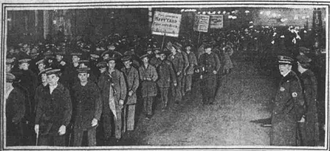
LEAGUE ISLAND'S SAILORS TURN OUT IN DEMAND FOR FASTER TRANSIT