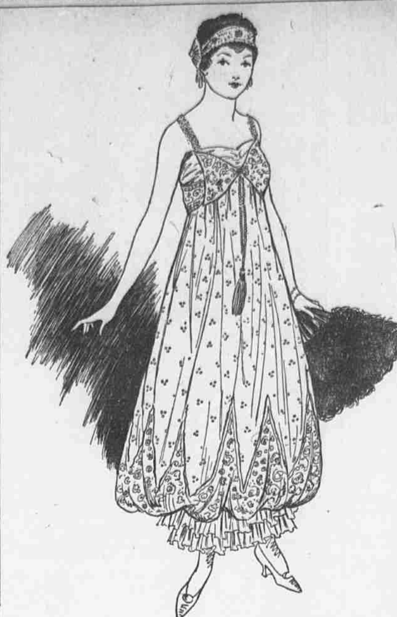
A NEW STYLE IN EVENING GOWNS

Follow these articles carefully; practice them in your own home; you will be delighted with the progress you make! The lessons appear every Tuesday and Thursday.