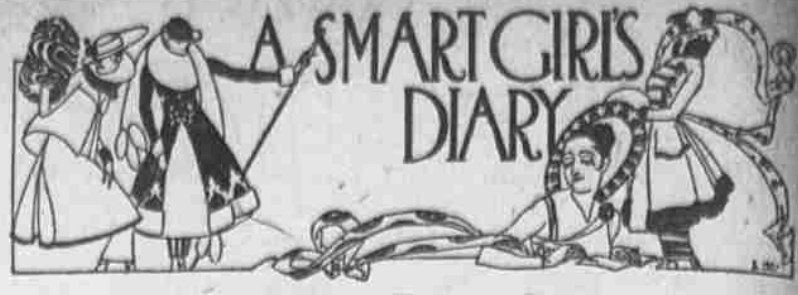
The New Evening Gown

I have just returned to town and found the most delightful invitation awaiting me. One of my best girl friends is going to be married and a big dance is to be given in honor of the occasion.