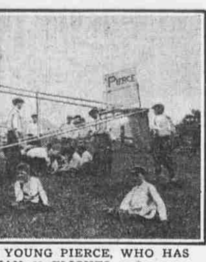
26-FOOT GLIDER BUILT BY YOUNG PIERCE, WHO HAS MADE MORE THAN 50 FLIGHTS

expressing myself, which means success. "So, for the same reason," she continued, "give a child a chance to express himself, although often not found until late in life, sometimes not at all because of a lack of encouragement.