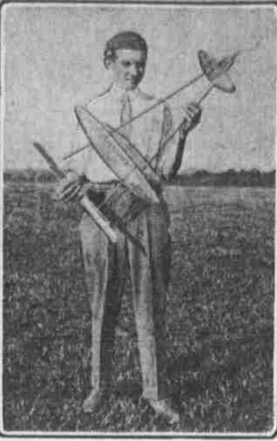
A TOY AEROPLANE