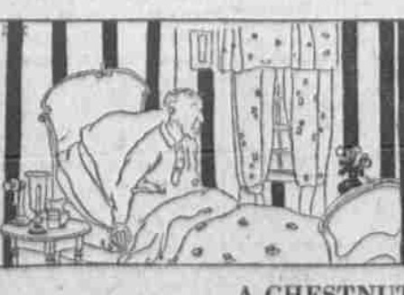
A CHESTNUT HILL FELON