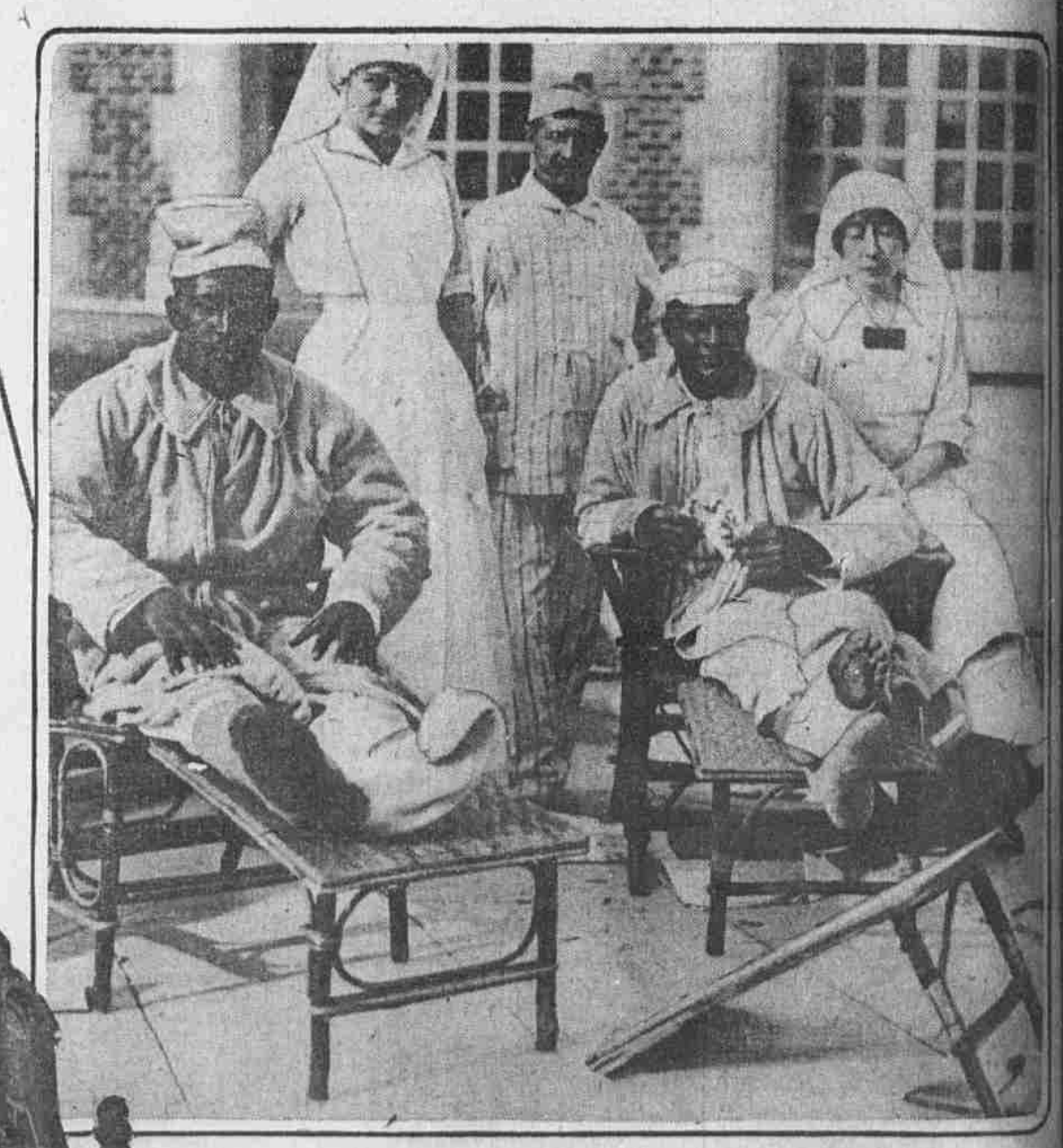
AMERICAN GIRLS NURSE WOUNDED ALGERIANS The dark-skinned Turcos from Northern Africa are said to be highly appreciative of the attention they receive at the American Red Cross Hospital at Neuilly, which is supported by the contributions of rich women.