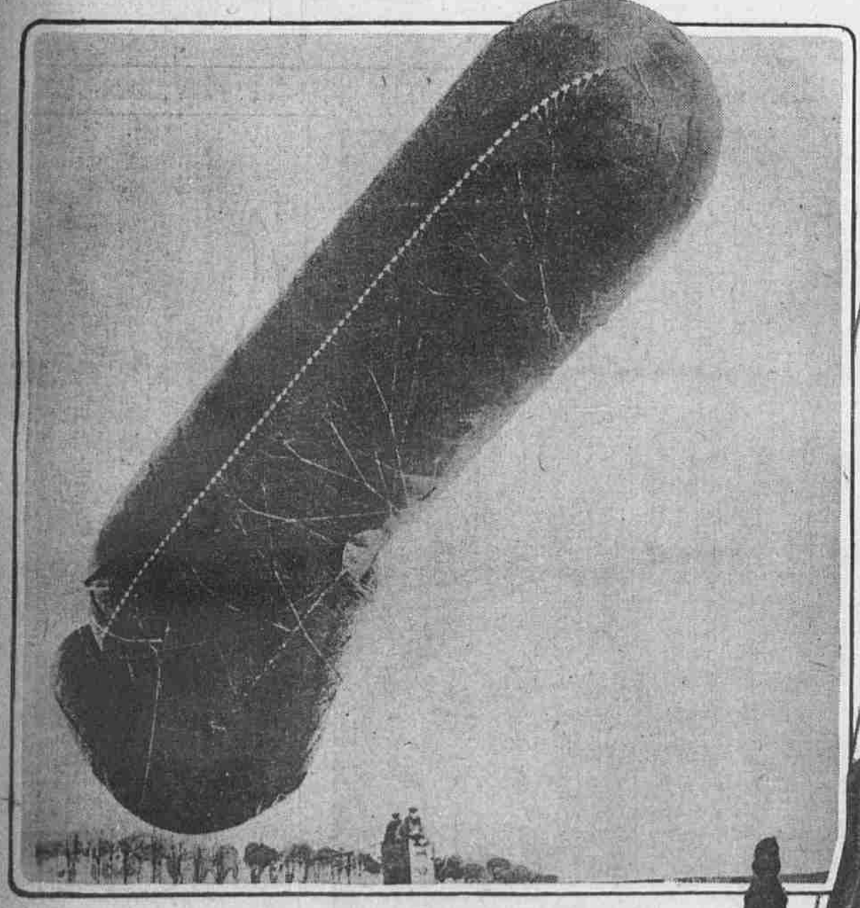
GERMAN WAR BALLOON IN ARGONNE REGION This is an air craft of the semi-rigid type favored by the Kaiser's forces in obtaining the enemy's range, which nowadays can be calculated with mathematical accuracy. Communication with the ground is kept up by telephone.