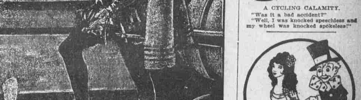
5. Puts a match to it...