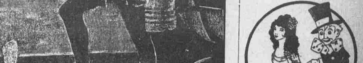
She-my sister thinks you are awfully good looking. He-Indeed! But she flatters me, I'm sure. She-That's what I told her.