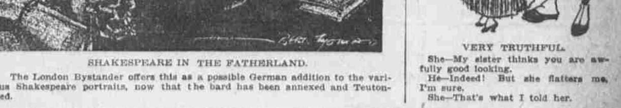
The London Bystander offers this as a possible German addition to the various Shakespeare portraits, now that the bard has been annexed and Teutonized.