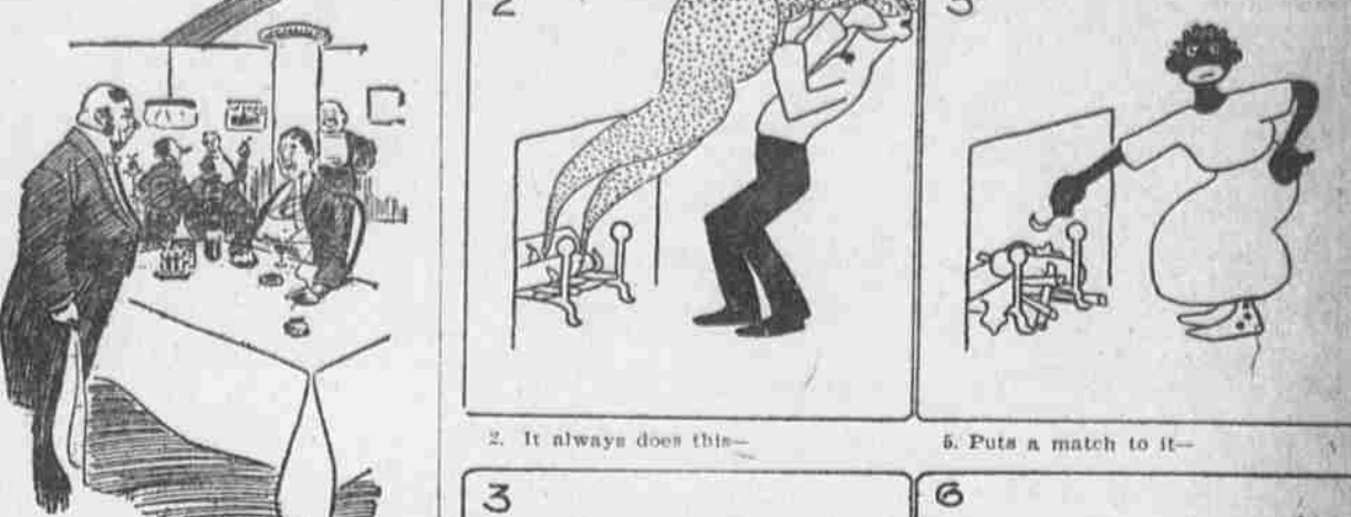
2. It always does this...