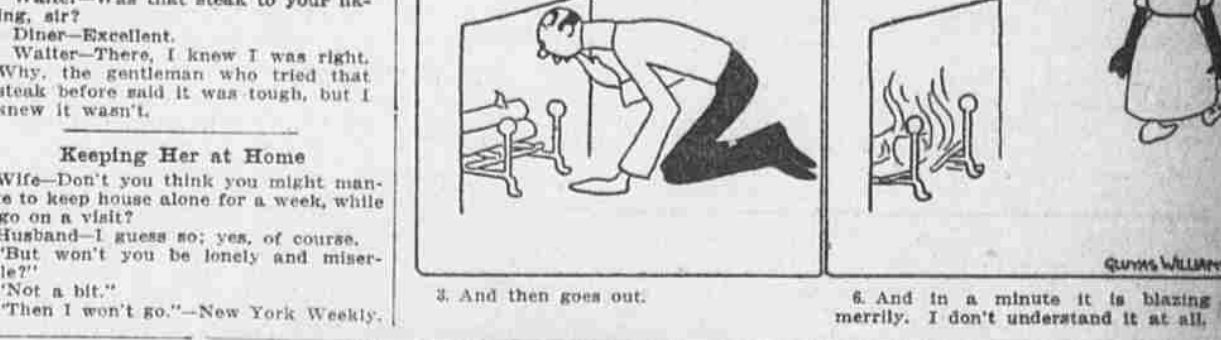
3. And then goes out...