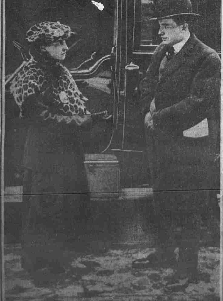
DIRE TAXI-CHAUFFEUR IS BUSINESSUATE

OLD-TIME GANGPLANK NOW USED TO TAKE ON PASSENGERS AT KAIGHN'S POINT A relic of a former era in river transportation has come back again since the destruction last Sunday of the ferryhouse at Kaighn avenue, Camden. A temporary platform has been created to serve as a landing place, imparting to the scene a flavor of early days in the Quaker City when traveling conveniences were few in number.