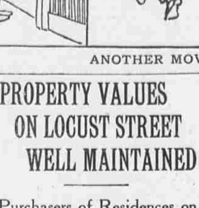
ANOTHER MOVIE OF A HANDY MAN ABOUT THE HOUSE

VEGETABLES Demand fairly active and values of choice stock generally firm. Sweet potatoes and onions a shade higher.