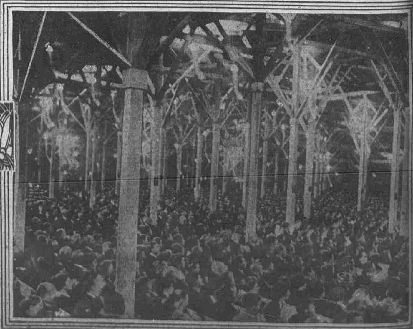
PART OF THE CROWD OF 19,000 WHICH HEARD FIRST SERMON OF PRESENT CAMPAIGN Persons took their places in line before the doors an hour before dawn in order to make sure of seats at the opening service. Almost 1000 were in line before 6 a. m., some coming many miles.