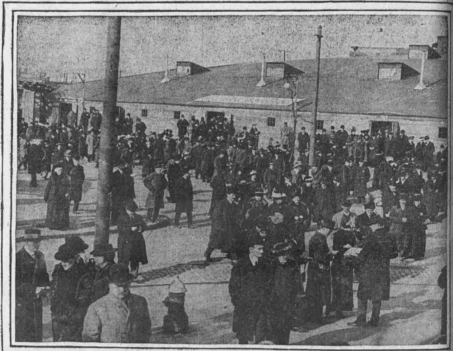
THROUGH POURING OUT OF TABERNACLE'S NUMEROUS DOORS There are 29 entrances and exits in the auditorium building and since all vehicular traffic is kept away from the building itself, the tabernacle can be quickly emptied. It is estimated that 65,000 persons heard the evangelist in his three sermons of the first day.