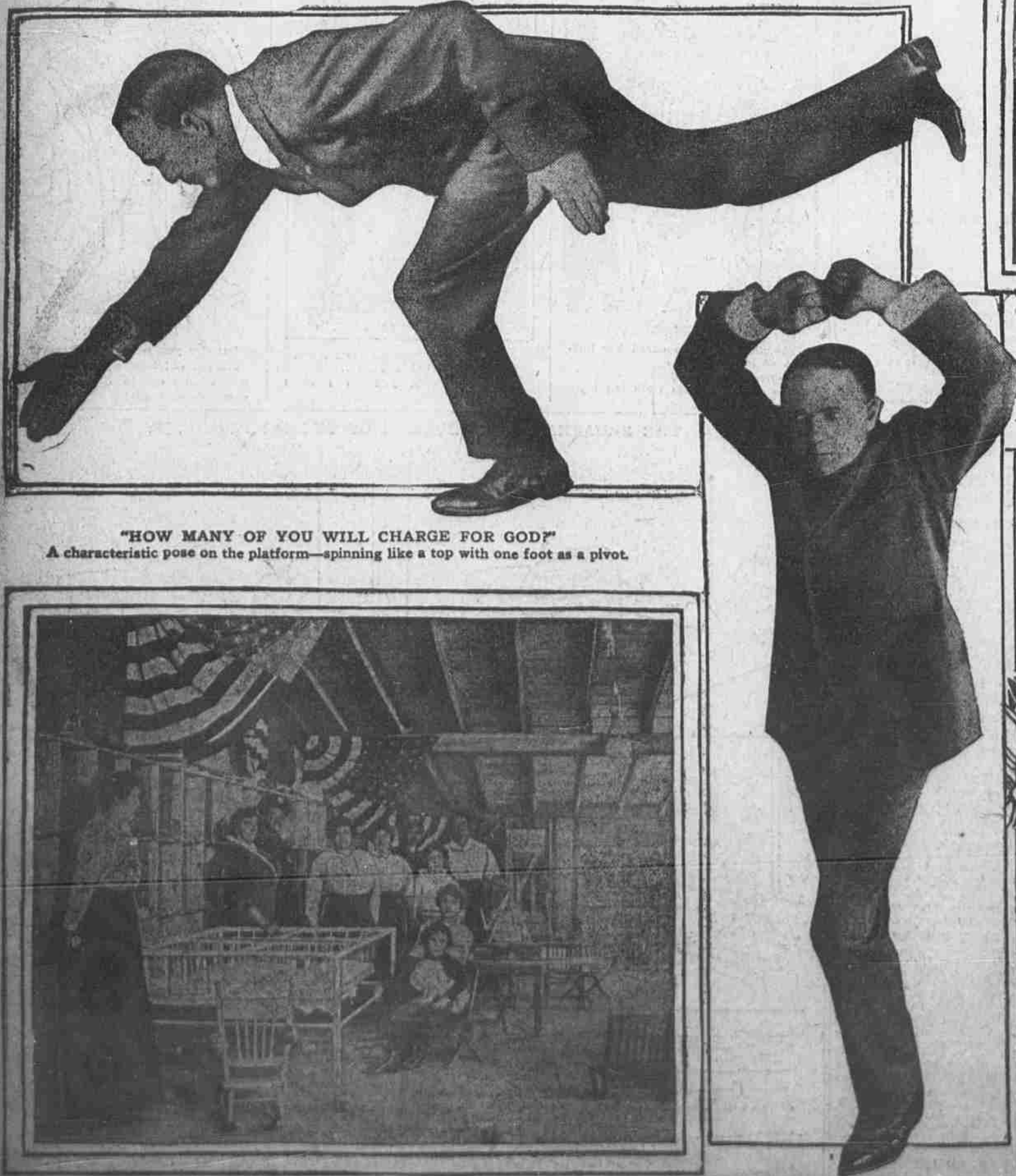
"HOW MANY OF YOU WILL CHARGE FOR GOD?" A characteristic pose on the platform—spinning like a top with one foot as a pivot.