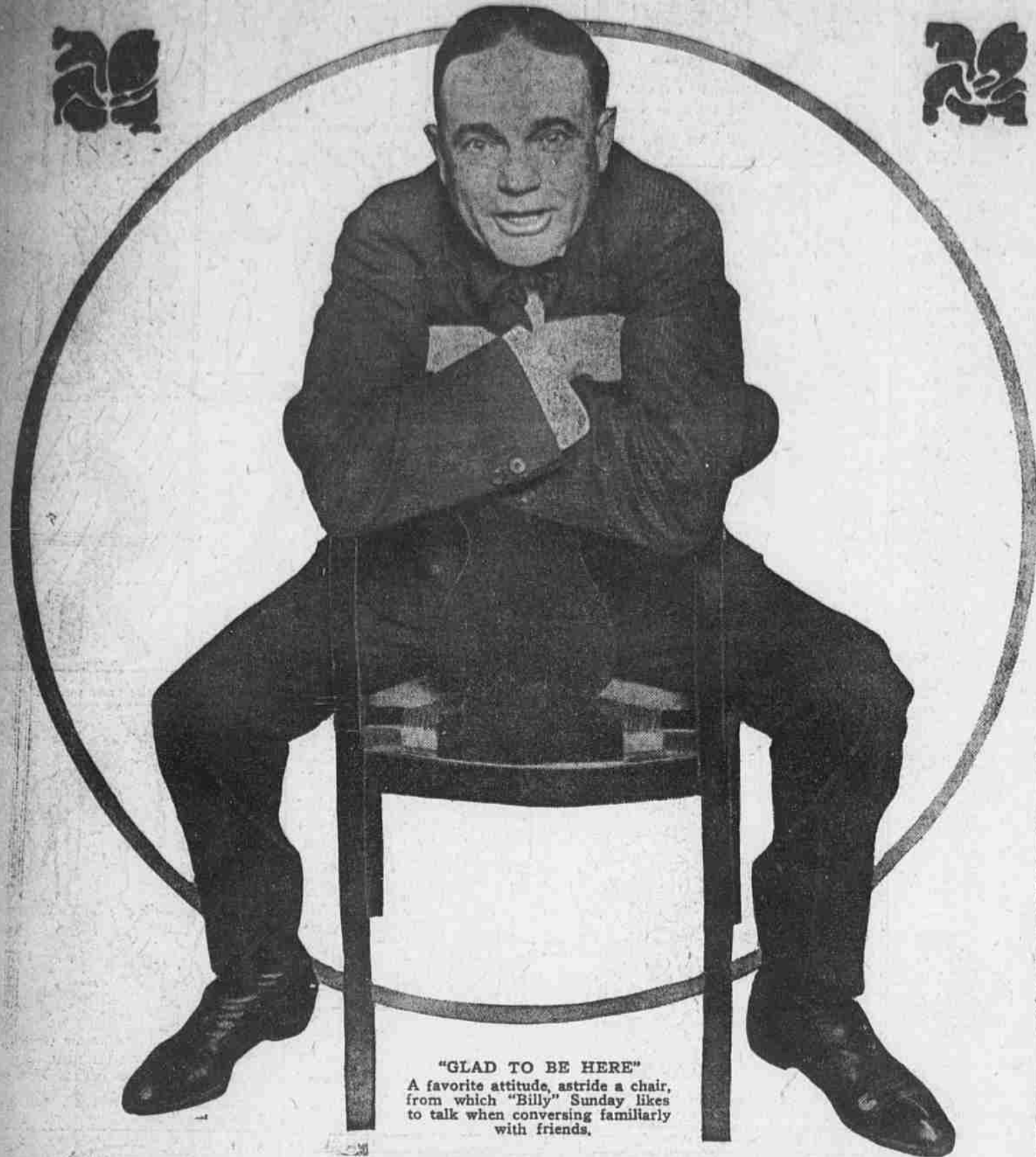
"GLAD TO BE HERE" A favorite attitude, astride a chair, from which "Billy" Sunday likes to talk when conversing familiarly with friends.