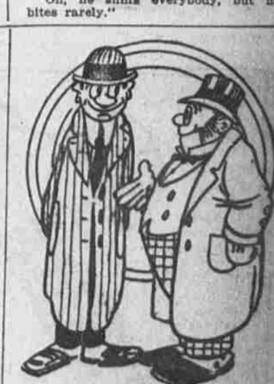
REALIZATION. Pat-Do you believe in dreams? Mike-I dol Last night I dreamed I was awake an' in the morning my dream came thrus!