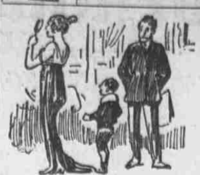
"Mamma, are you going to bed? You wear a nightgown. "Not at all, dearle. I am going out