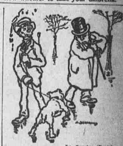
A PARTICULAR DOG. "Eh, there! Your dog is sniffing "Oh, he sniffs everybody, but he bites rarely."