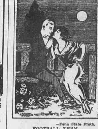
FOOTBALL TERM. A fake kick-If you do I shall