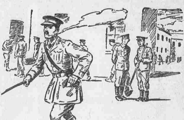
-London Opinion. First Recruit (with hauteur)-'Ow d'ye suppose 'e got 'is commission? Second Recruit (who has just been reprimanded)-'Ow? I suppose 'e collected a 'undred eigarette coupons