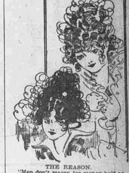
"Men don't marry for money half as often as they are supposed." "No: because half the girls are not so rich as they are supposed."

Fifi-Have you heard of my engagement? Mimi-No-er-who's the plucky man?