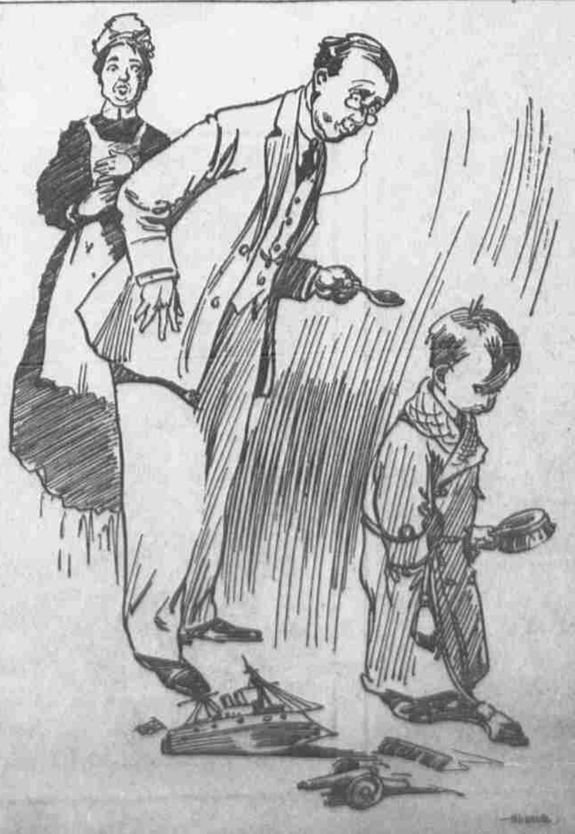
Father drying to give the concented done Well, well, you are a funny box. Might I ask why this sudden extraordinary matter for jame? The Chip Tota I blisse it's missed.