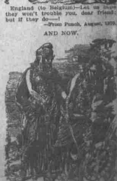
AT THE POST OF HONOR