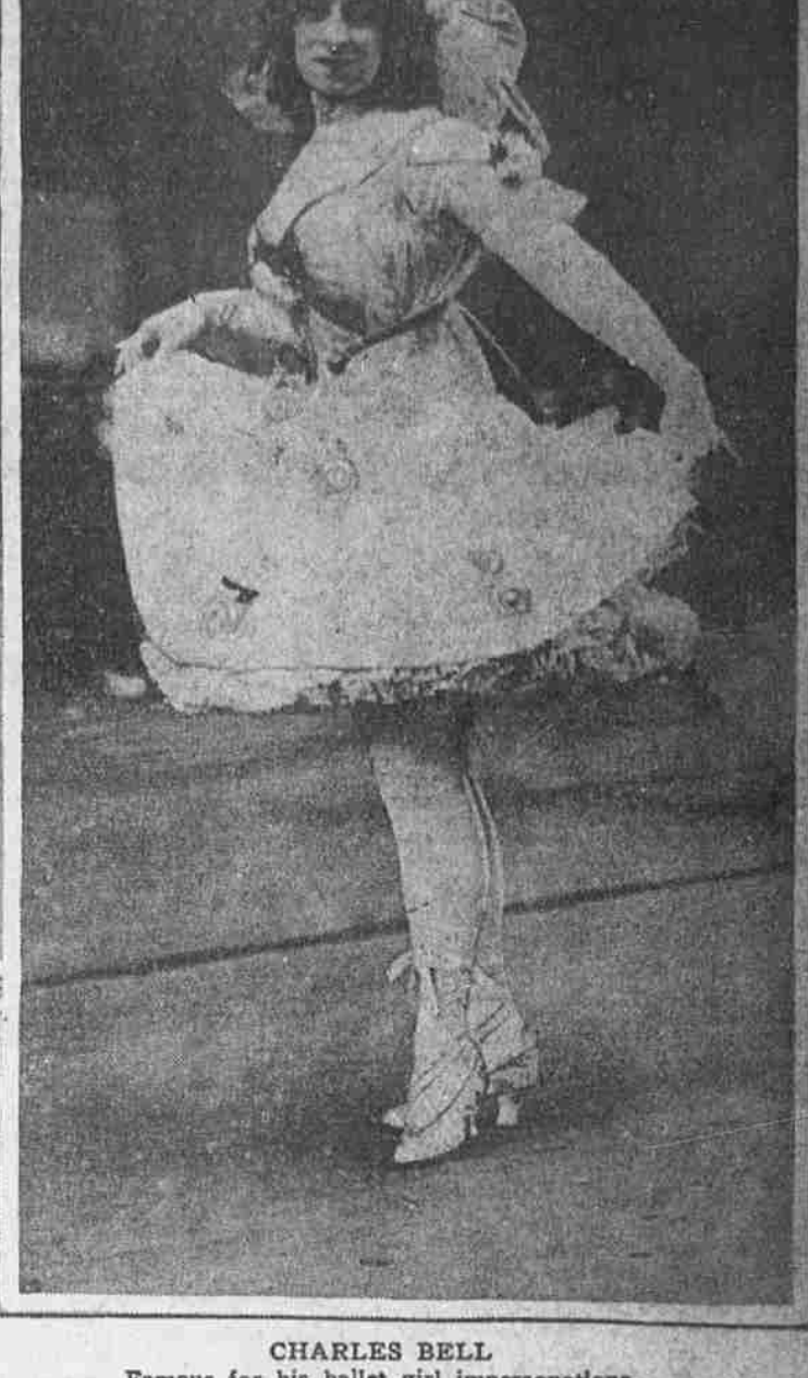
Famous for his ballet girl impersonations.

THIEVES IN 7 LOGAN HOMES, 4 OF THEM IN ONE BLOCK