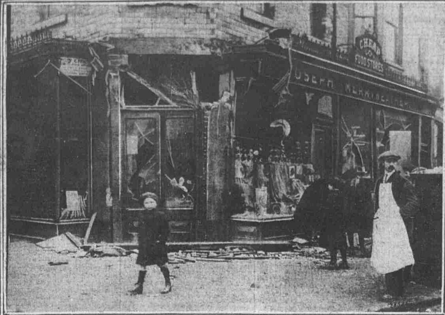
Above, to the left, is a shop in Prospect Road, Scarborough, where the wife of the proprietor was killed by a shell. On the right is the house of Walter Rea, Member of Parliament from Scarborough, showing the yawning hole made by the Germans' 8-inch guns. Below are the historic ruins of old Whitby Abbey, at Whitby, as they appeared after suffering a bombardment of 20 minutes.

Reading Official Admits Move to Raise Tariffs on Nearby Foodstuffs Shipped From West. A further advance in freight rates generally, independent of the 5 per cent increase granted by the Interstate Commerce Commission in its decision of December 18 last, along the lines of readjustment suggested by the Commission is now being planned by the Eastern railroads.