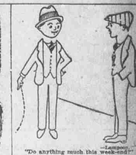
"Do anything much this week-end" "Oh, nothing to speak of." "Anything not to speak of?" "Have you been staying here long?"

"Well, about three cooks and four housemaids long."—Man Lacht.