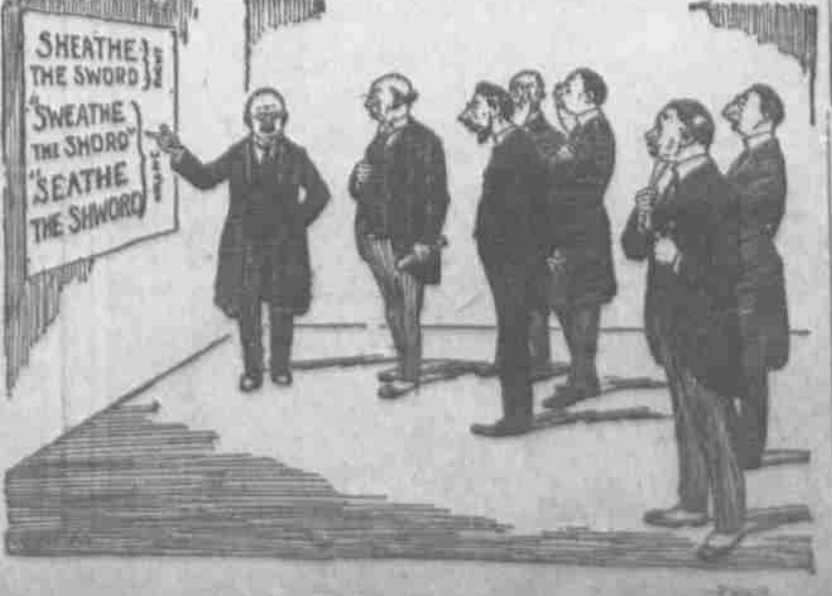
UNRECORDED SCENES FROM THE HISTORY OF THE WAR. speakers attend a clear for the purpose of insuring to and ourcestly the phrase: "We shall not should the award until, sin, siz-